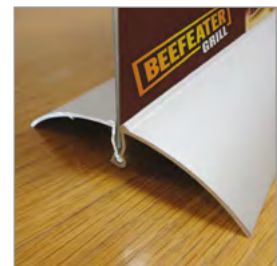
Spring-powered 'grip-action' bases