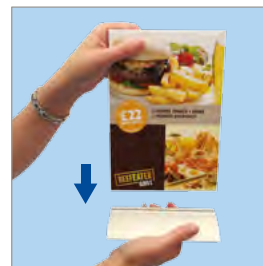
Simply grip the base open and insert the sleeve