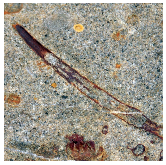
Scaphopod and snail fossils