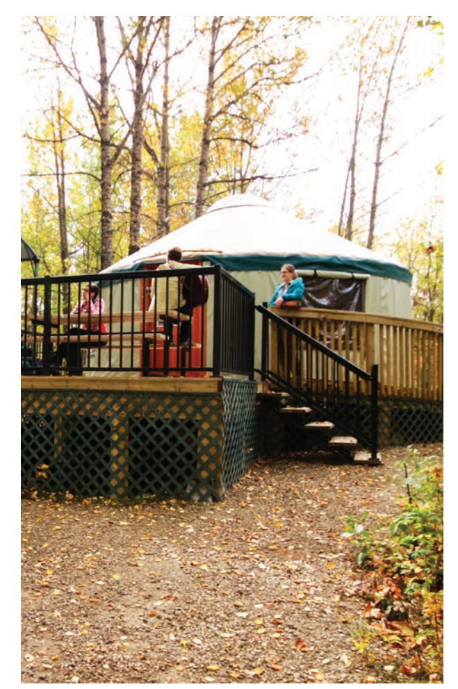
Yurts at Pigeon Lake Provincial Park

Cover Photo: Lawrence Lake Provincial Recreation Area Updated February 2024