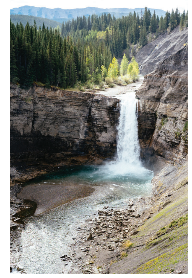
Waterfall - Ram Falls Provincial Park

Please contact 310-LAND (5263) for dangerous wildlife encounters, threats to personal or public safety or serious noise complaints. If you have questions or experience difficulties during your stay, speak to park staff.