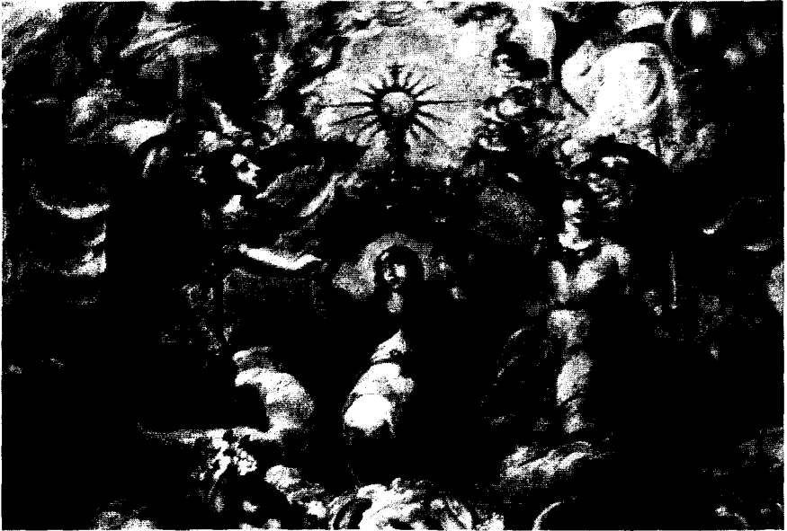
Figure 6. Cristóbal de Villalpando, Virgin in Glory , 1688-1689 (detail). Mural painting, Royal Chapel, Puebla.

soul for whom she was praying climbed each perfect step and bid this world good-bye as it was received in the next. 84 On some occasions, while praying in church, she was astonished to see her prayers take on the form of vapors which rose into the vaults and transformed into clouds populated with multitudes of angels and saints. At other times she would see heaven respond to her prayers by showering flowers down from the ceiling, “simbolizando el delicioso jardín de virtudes que adornaban su dichosa alma.” 85