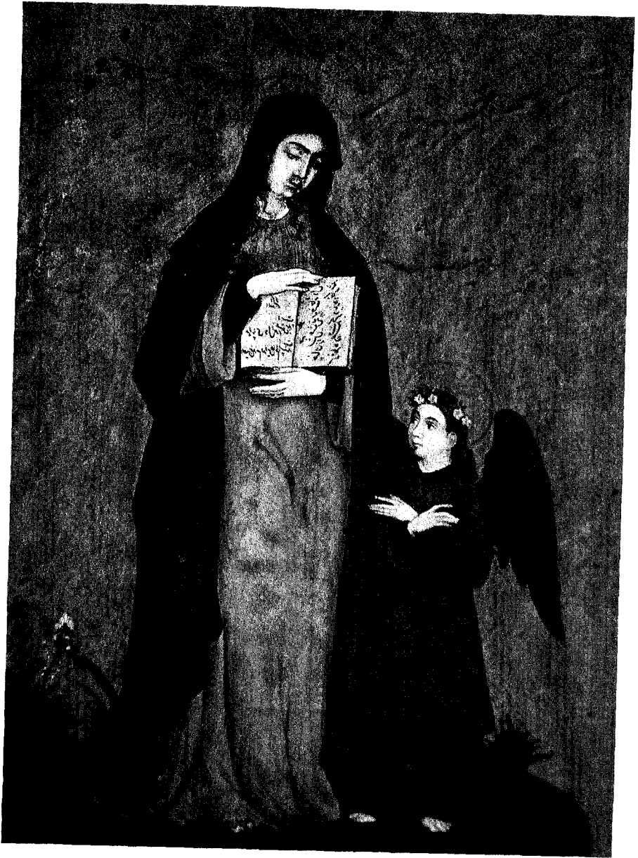
Figure 1. The Virgin Mary Attended by Angel , ca. 1610. Watercolors on paper, Mughal School, Lahore Museum, Lahore, Pakistan.