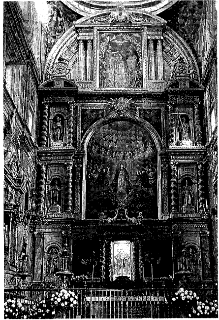
Figure 3. Altar de los Reyes with the Assumption , by Pedro García Ferrer (before 1649). Royal Chapel, Puebla cathedral.

Catarina's vision. Another example, which Catarina would almost certainly have known, is the Assumption in the altar of the Kings in Puebla cathedral—before 1649—by Pedro García Ferrer (1583-1660) [figure 3]. 59 García Ferrer's bright if rigid painting, however, represents only the final scene in Catarina's apparition. The Virgin is already in Heaven, and stands atop a full moon with the twelve stars around her head and sunbursts ringing her body. The stellarium , or ring of 12 stars around the Virgin's head, became common in Hispanic painting at the end of the seventeenth century, and the moon is a standard feature of Immaculate Conception imagery. Although souls do not grasp her raiments as in Catarina's account, multitudes of angels support her by holding onto her gown. Nearly identical in its composition, but more fluid and diffused with a softer light, is a later Assumption , in the chapel of the Rosario in Puebla—before 1690—by José Rodríguez Carnero (died in