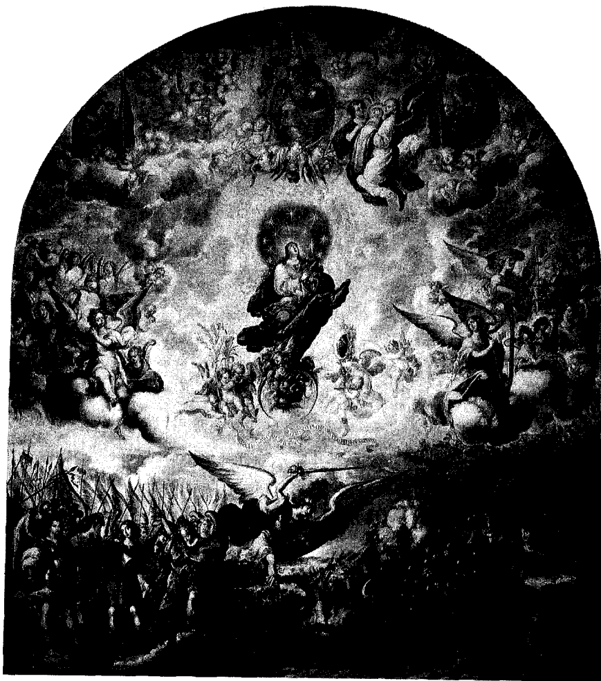
Figure 8. Cristóbal de Villalpando, The Woman of the Apocalypse , 1685. Oil on wood panel, Sacristy, Mexico City cathedral.