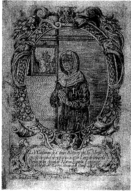
Figure 2. La V. Catharina de S. Ioan Natural del Gn. Mogol , 1690.

Drawn by Joseph Rs. Juene and engraved by Pedro de la Rosa, Puebla.