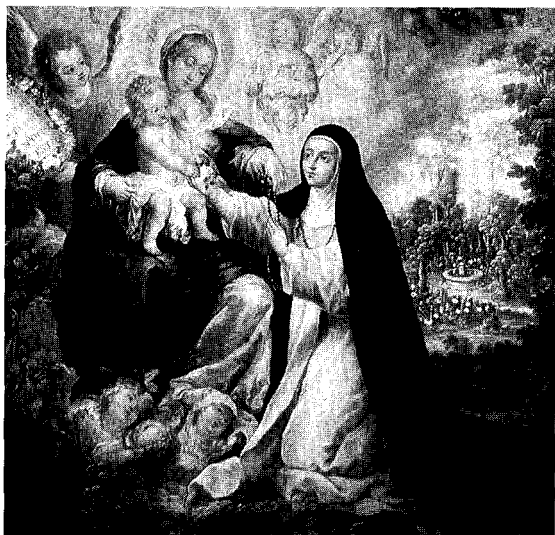
Figure 7. Nicolás Correa, Vision of St. Rose of Lima , ca. 1691. Oil painting on canvas.

vapors serve simply as a frame accentuating the separation of the human and the divine—“a diaphragm-like object whose role is to relativize the actual visibility of the event” 87 —and do not themselves represent an abstract concept. The use of scattered flowers to denote God’s grace, on the other hand, does appear often in paintings, for example José Juárez’ SS Justus and Pastor (1658), or Villalpando’s The Marriage of the Virgin (late seventeenth century). 88 Although it is made of wood and not clouds, a Jacob’s ladder depicting angels climbing to heaven is included among Juan Correa’s panels in the chapel of the Angels in Mexico City cathedral. 89