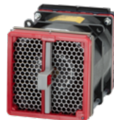
2U Hot swap fan modules