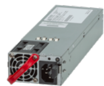
2.4kW Hot swap power supplies