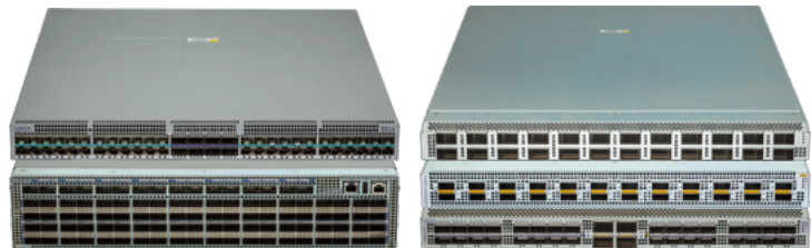
Arista 7280R3 Series

7280R3 support for 100G QSFP incorporates a flexible choice of interface speed including 25G and 50G providing unparalleled flexibility and the ability to seamlessly transition data centers to the next generation of Ethernet performance. The 7280R3 Series provide industry leading power efficiency with airflow choices for back to front, or front to back. An optional built-in SSD supports advanced logging, data captures and other services directly on the switch. Combined with Arista EOS the 7280R3 Series delivers advanced features for big data, cloud, virtualized and traditional designs.