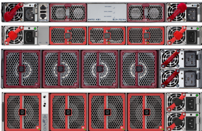
Arista 7280R3A 1 and 2RU Rear Views AC Powered, Front to Rear airflow (red)