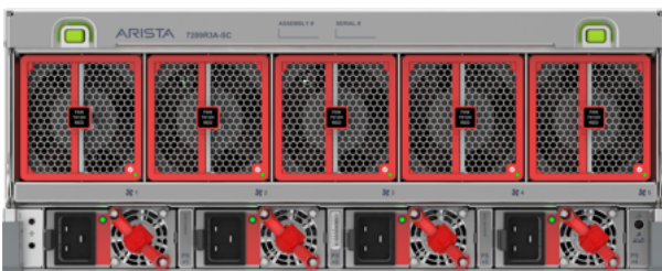
System Rear (Front to Rear Airflow)