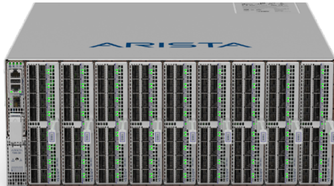
Arista 7280R3A: 144 ports of 100G or 36 ports of 400G

All elements of the 7280R3A modular are field replaceable, and optimized for simple maintenance, a broad range of network interfaces with a choice of industry standard interfaces allowing for easy transitions to the latest 100G/400G networks. Combined with Arista EOS the 7280R3A series deliver advanced features for high performance large scale layer 2 and layer 3 cloud designs, enterprise data centers and service provider networks.