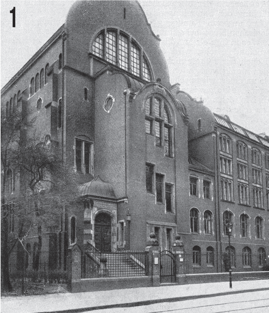
1. Museum of Natural History of the University of Wrocław, at Sienkiewicza 21, Wrocław, Poland (1904)

Among the museum's collections there were (and still are) numerous interesting and unique specimens of extinct and rare species. Several important collections are held in its halls, including a few insect collections that originally belonged to respected and well known entomologists. Among these we find Niepelt's collection of about 13,000 specimens of exotic Lepidoptera primarily collected in South America, Indonesia's