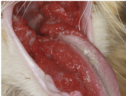
Fig. 2. Occasionally, the proliferative inflammation can be so severe as to prevent the tongue from retracting into its normal and functional position.

Increased levels of CD8+ (cytotoxic) T cells, compared with CD4+ (helper) T cells, have been detected locally as well as in the systemic circulation, suggesting that the inflammatory response seen in FCGS is a cytotoxic cell-mediated immune response to antigenic stimulation likely from intracellular pathogens such as viruses. 7,26,27