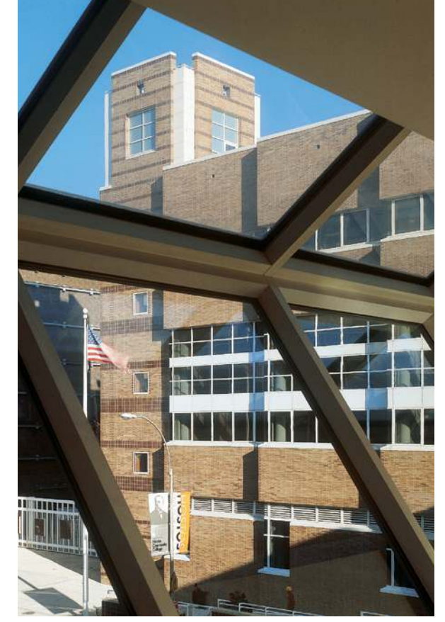
Tower from pedestrian bridge