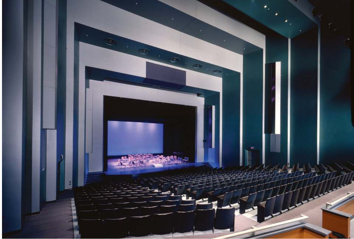
1,000 seat main theater