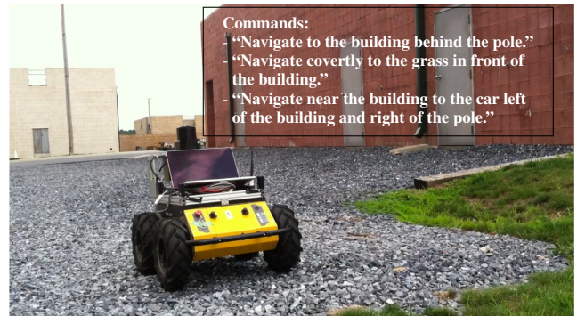
Figure 1: Clearpath™ Husky robot used in the experiments

method proposed in [Munoz, 2013] which has been proven effective in outdoor environments [Munoz et al. , 2010]. The semantic perception module receives scene images from a 2D camera and classifies each object into categories with different confidence values.