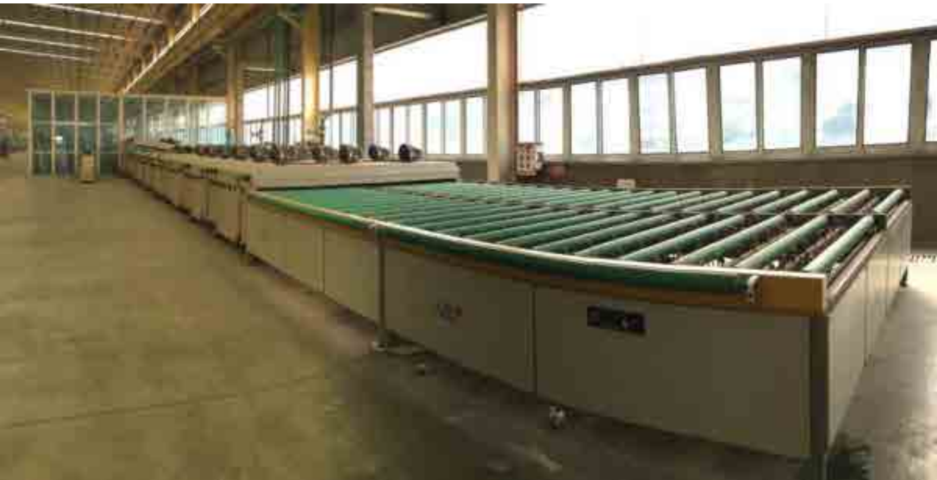
Automatic Ceramic Silk Screen Line Thickness:8-60mm Size: 3,200*6,000mm