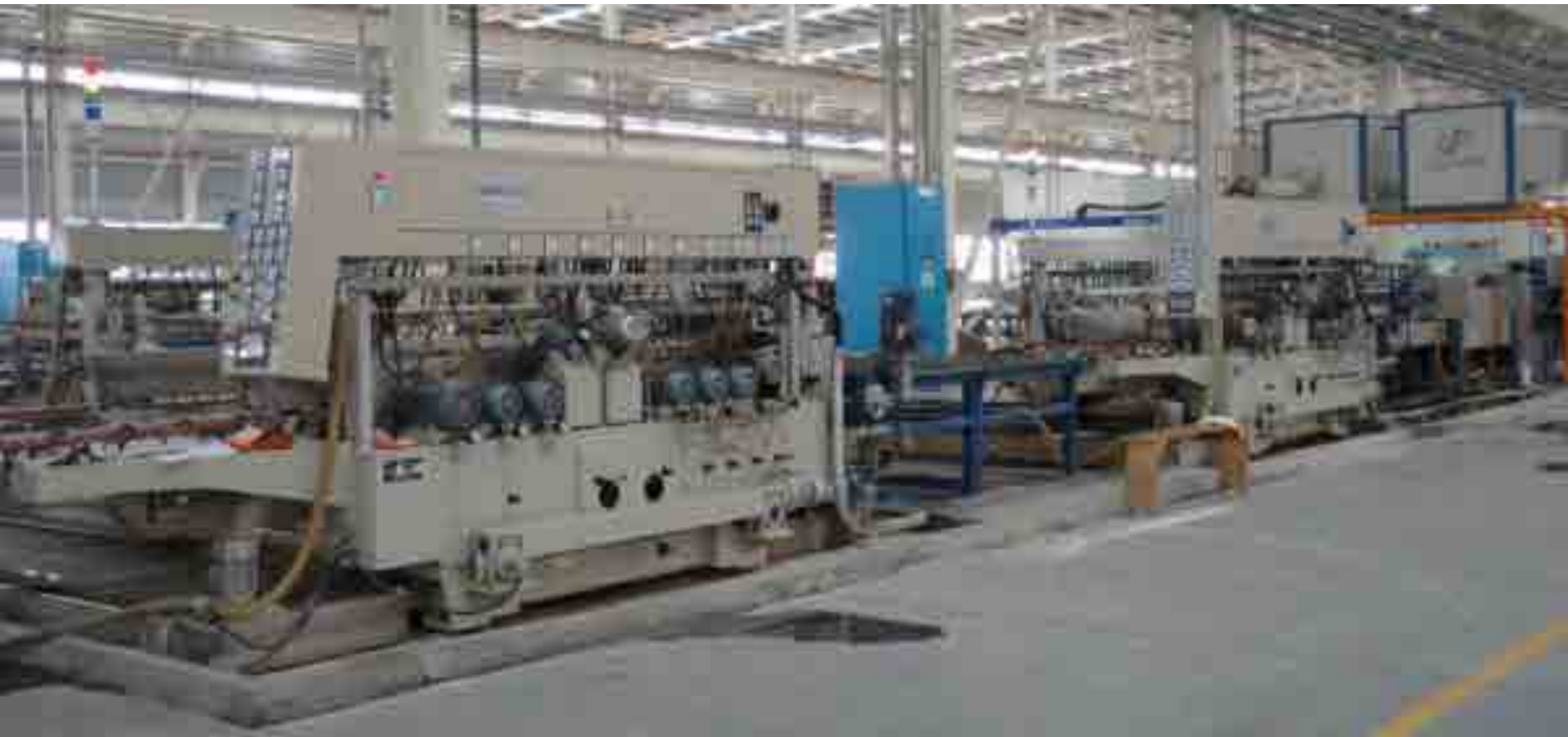
Edge Grinding Machines: Capacity/day:15,000m 2