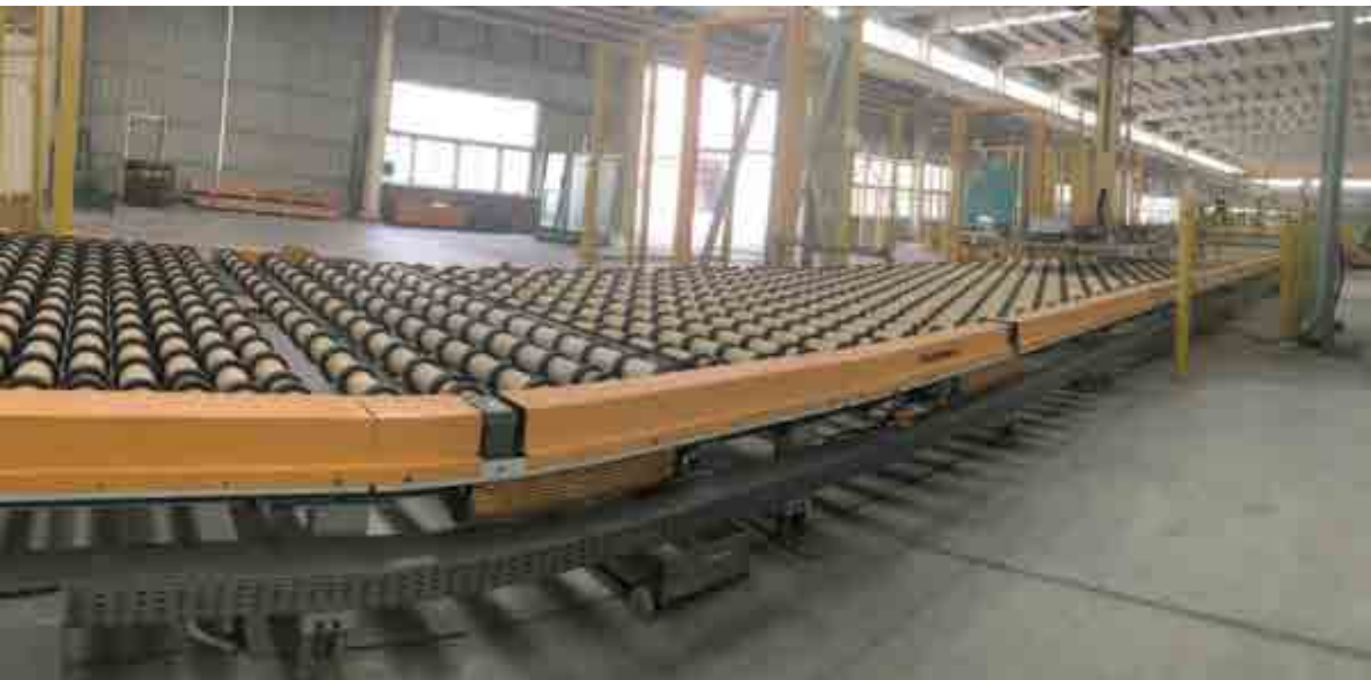
Automatic Glass Cutting Line: Imported from Germany Grenzebach. Capacity/day: 8,000m 2