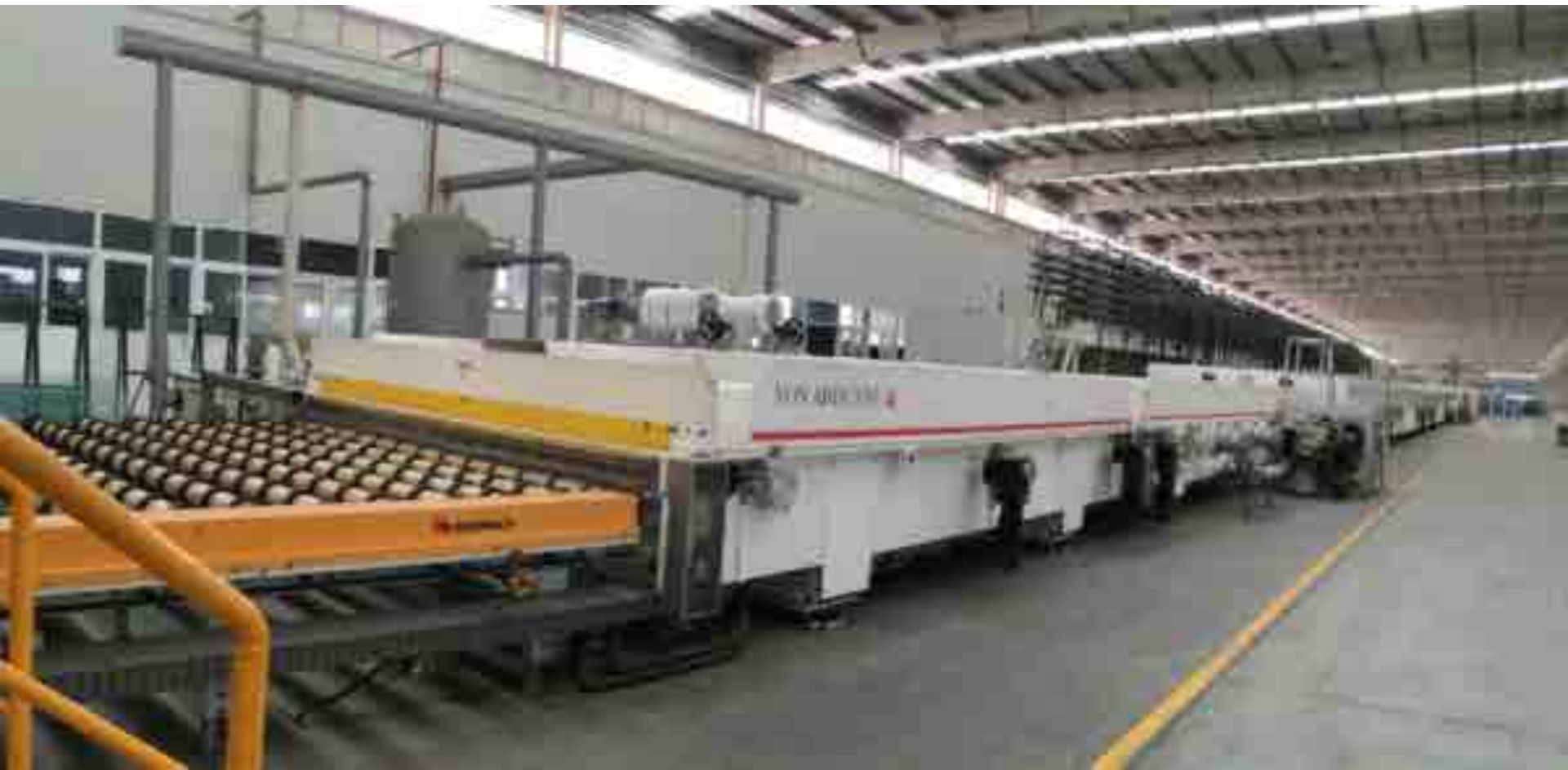
Automatic Glass Coating Line: Vacuum magnetron sputtering, imported from Germany Von Ardenne. Max. Size: 3,300*6,000mm Capacity/day: 21,000m 2