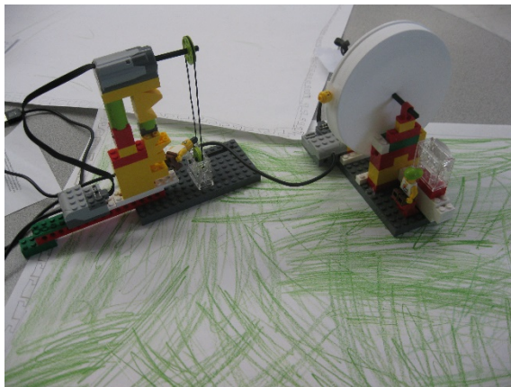
Figure 1: Example of WeDo™ robot

Diana's curriculum used the LEGO® Education WeDo™ Robotics Construction Set . This is a robotics kit designed for children 8 to 11 years old that allows children to build LEGO® robotics that feature working motors and sensors (see Figure 1). The construction kit contains more than 150 elements including a motor, tilt sensor, motion sensor, a LEGO® USB hub, gears, and a variety of LEGO® bricks. Once a robot is built, children connect their robots to the computer using the USB hub and create programs using the accompanying WeDo™ software. This software is an icon-based drag-and-drop software, powered by LabVIEW™ , and the on-screen programming icons fit together like puzzle pieces (see Figure 2).