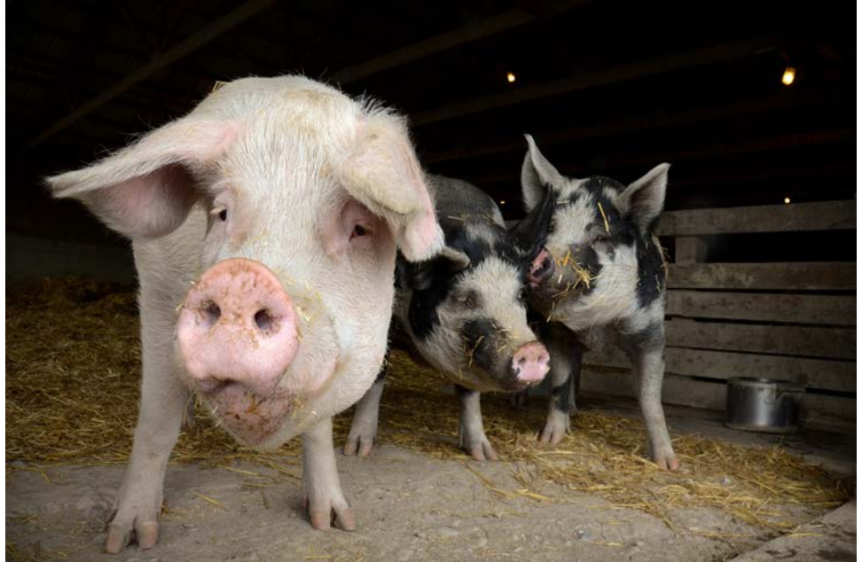
Fig, Joan, and Fiona interacting in a social group.

Pigs pass the “pointing test” — they can locate a food reward using the cue of a human pointing to it.