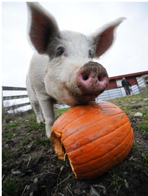
Violet playing with a pumpkin.

The ability to categorize objects, for example, might be demonstrated by having an animal put all items of the same color together regardless of the items' shapes. Understanding that there are more blue circles than red