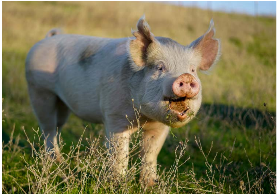
Lola, expressing her unique personality.

The body of findings on pigs' perspective-taking, sensitivity to attention state, and social preferences shows that they belong in a group of very sophisticated animals, such as great apes, ravens, and dolphins, all of whom possess a keen and nuanced understanding of their role in their social group.