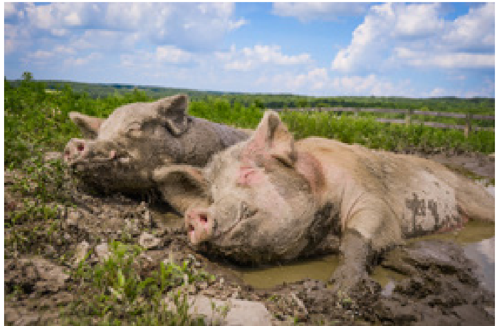
Chuck and Honey cooling in the mud on a summer day at sanctuary.

complex personalities, just like those seen in other animals, including humans. The study of personality in pigs is critical to our understanding of “who” they are.