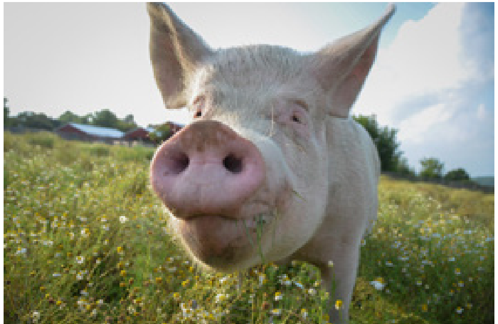
Honey playfully greeting her photographer.

In a similar study of emotional contagion in pigs, researchers housed pigs in groups of six and trained two pigs from each group to anticipate food (a positive outcome) or social isolation (a negative outcome). Two pigs from each group learned to associate the music of Bach with food, and two others learned to associate social isolation with a military march. The music was played to two other pigs (“naïve” pigs), but without any positive or negative association. When the music was played in a group setting, a few of the trained pigs showed either “happy” behaviors (play behavior, wagging their tails) or stress (standing alert, laying their ears back, urinating, and defecating), depending on the music they heard. The researchers observed that when a naïve pig was near a trained pig who acted stressed, the naïve pig also became more alert and also laid her ears