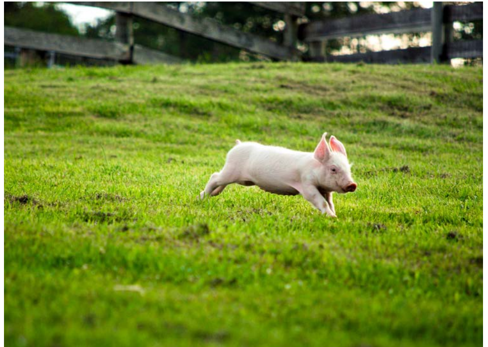
Kim Gordon leaping in characteristic piglet play.

Play is so important in the development of animals that the lack of opportunity to play can lead to behavioral abnormalities. 17,18,19 Young pigs reared in enriched environments where they can interact with objects and