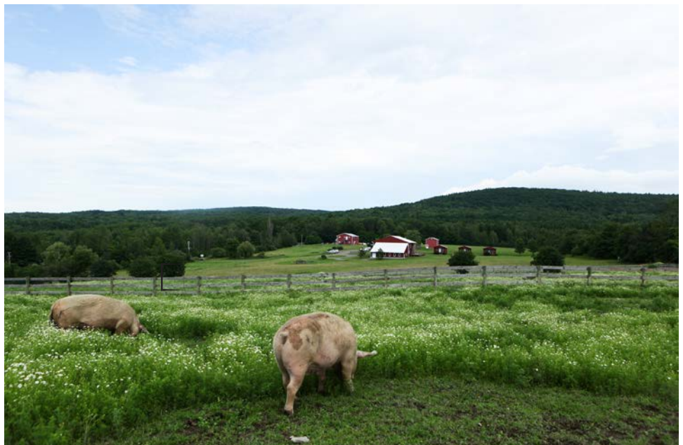
Pigs foraging in a field of chamomile.

require locating desired objects. The holeboard procedure is one particularly effective method for studying spatial learning and memory in pigs and other animals. The holeboard is an open area in a large room with many holes, or wells, that can be baited with food. Pigs, then, can be observed as they forage with their snouts in the wells as they would by rooting in the ground in a natural setting.