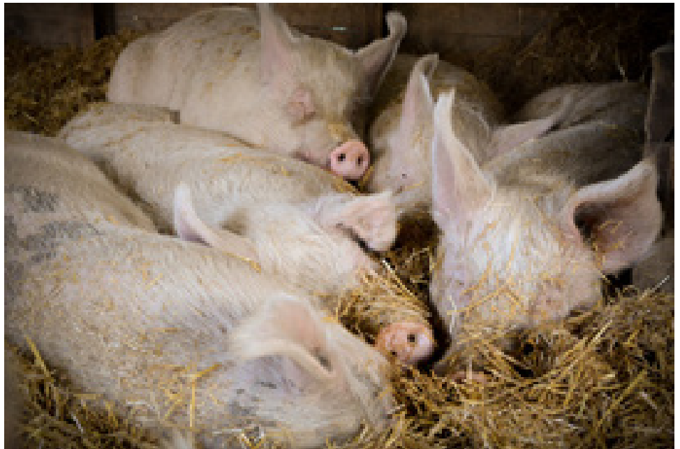
Portia, Nikki, Chuck, Honey, and Ellen sharing a peaceful moment resting in their barn.

Pigs exhibit emotional contagion, a capacity thought to be the basis for empathy, or the ability to feel the emotional state of another. Emotional contagion is the arousal of emotion in one individual when witnessing the same emotion in another individual.