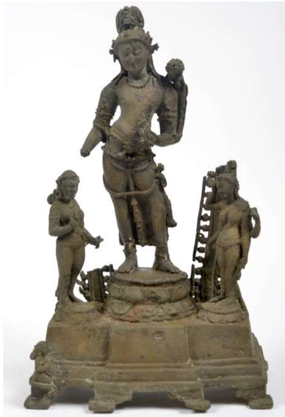
Lokanatha with Tara and Bhrikuti 9 th century CE W:12 cm., H:20 cm. Nalanda, Bihar Acc. No. 47.45