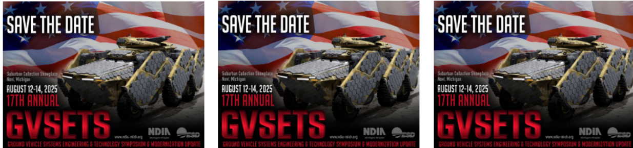
Figure 2: A sample multi-column figure. These must be either at the top or bottom of the page.

Listings must use a mono spaced font such as Courier, Cascadia Code, Consolas, etc. A smaller font is appropriate to make the code stand out but no smaller than 8 points is acceptable.