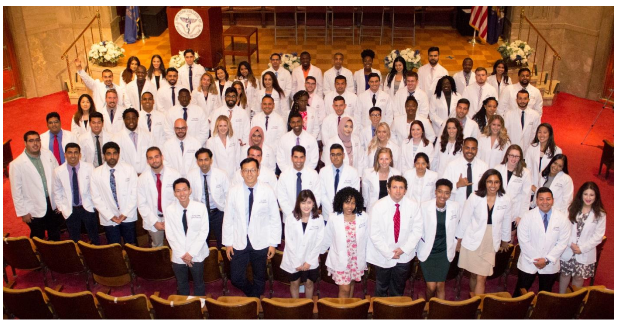
The annual White Coat Ceremony symbolizes lifelong commitment to serving the health care needs of patients.