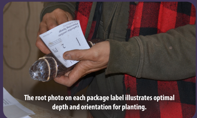
The root photo on each package label illustrates optimal depth and orientation for planting.

*These are perennial plants. We do not guarantee they will bloom the first growing season.