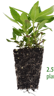
2.5" x 3.5" plant from 3-pack

the soil type, but they may be used if desired to encourage more rapid establishment. Combine amendments into each hole or apply in advance over the entire surface of the site. If adding organic material, only use moderate amounts and mix thoroughly with existing soil. Do not create a pocket of soil around the roots that is markedly different from the surrounding original soil.