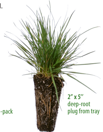
2" x 5" deep-root plug from tray

After the planting holes are prepared, remove plants from the pre-moistened container. DO NOT pull on top growth before firmly squeezing the pot sides and pushing up through the bottom holes. Once the mass is loose, continue to squeeze sides and gently wiggle the plant to release the root ball intact. Hold the plant so that the top of the soil around the plant is at the same level as the surrounding soil. Firm in place, forming a slight dish to hold water. Watering gently but deeply will settle the soil around the roots and allow new, and deeper root formation. We suggest marking the location of any new plant with a sturdy tag that will stay in place through the establishment phase. This will help to ensure that the plant receives the early care that it might require. It can also ensure that a desirable plant is not mistaken for a weed.