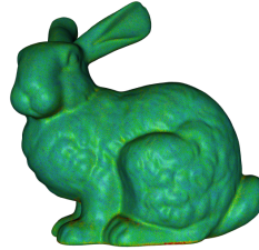
Fig. 2: An analysis of correctness: A comparison of several different reconstructions of the Bunny dataset at depth d = 9 created with the distributed implementation. The table summarizes the size of each model, and the maximum and the average distance of each vertex from the ground-truth. The image on the right shows the distribution of error across the p = 8 model. The color is used to show \delta values over the surface with \delta = 0.0 colored blue and \delta = 1.0 colored red.

second, we evaluate the scalability of our parallel implementation.