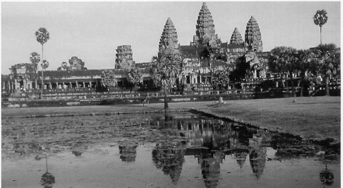
Figure 1. The Angkor Wat temple.

We believe that all three of the one-horned rhinos on these bas reliefs most probably represent Javan