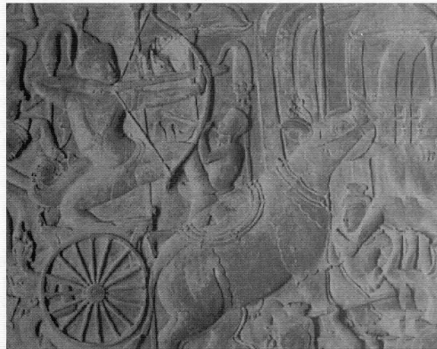
Figure 3. One-horned rhino shown in a bas relief in the North Gallery (east wing) at Angkor Wat.