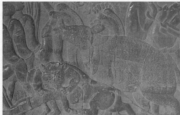
Figure 4. A rhinoceros without rider in the South Gallery (east wing) of Angkor Wat.