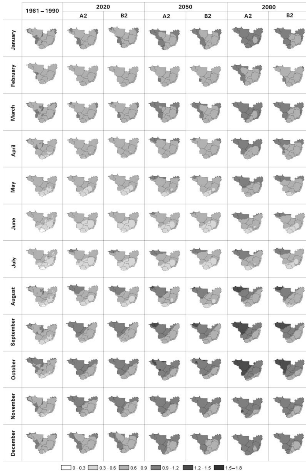
Figure 2. Maps of probable number of generations of Meloidogyne incognita race 4 on coffee plants, from January to December, for the climatological normal from 1961–1990 and future climates (2020, 2050, and 2080) in scenarios A2 and B2.