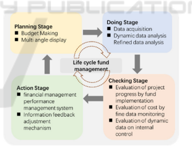
Figure 1: Cost elements of power science and technology project budgeting.

3) In the closing stage of science and technology projects, it is necessary to analyze and sort out the inspection results in the process of each science and technology project, formulate the revision scheme of relevant science and technology project management system, complete the financial settlement and audit of project funds, and put forward the use of funds.