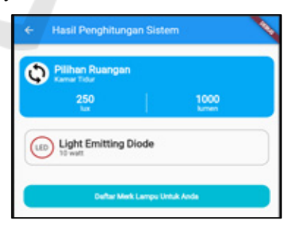
Figure 5: System Calculation Result Display.

If the parameters of the Base Shape and Room Size of the room are getting bigger, the greater the Lumen requirement will be. In addition, the Lux Requirement of the Room Type also affects the amount of Lumen required for the room. For example, if we changed the shape of the base into a (circle with a diameter of 200cm) and a room height of 300cm, and the type of room is a drawing room, the lumen requirement of the room is 2357 lm. The experiment required 2357 lm, while the first experiment required 1000 lm. This proves that if the parameter value is greater, the lumen requirement will also be greater, and the method used works correctly.