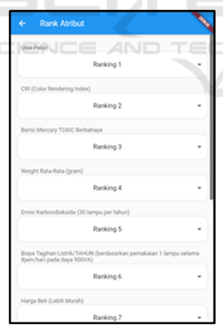
Figure 4: Rank Attribute-1 Page Display.