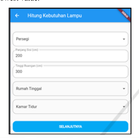
Figure 3: Data Entry Page Display.

The ranking above is used in the Simple Additive Weighting method, where rank 1 has the highest weight. Then, we will describe the calculations performed by the application system. Figure 3 is a Data Entry Page Display, the earliest display to enter data that will be processed by the system later. The Data is following input options from the test scenario. Then Figure 4 is a display of the Attribute Rank Page which can still be scrolled down again. Rank with number 1 has the highest value until number 11 has the lowest value.