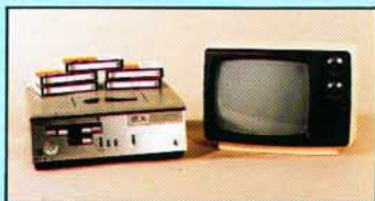
Video tape player