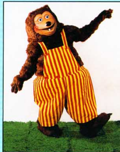
Billy Bob walk-around costume