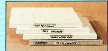
Four show tapes