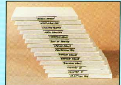
14 additional show tapes available at $500 each