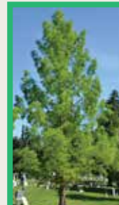
R DAWN REDWOOD ( Metasequoia glyptostroboides ) At the intersection of 330 North and Center Street look east and notice the (R) Dawn Redwood. Their needle like flat leaves turn a brilliant orange color in the fall before dropping. Then emerge a beautiful green in the spring/summer. Thought to have only been a fossil dating back 100 million years ago, this species was rediscovered in China in 1946. Seeds were then distributed to botanic gardens in the United States and England for propagation.