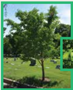
P GINKGO ( Ginkgo biloba ) Continue on 405 North to 1020 East (Olive St.) turn left and as you drive south on Olive, half way down notice the (P) Ginkgo on the west side. The Ginkgo is a living fossil. Basically unchanged for 65 million years.