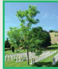
N KENTUCKY COFFEE TREE ( Gymnocladus dioica ) The (N) Kentucky Coffee Tree seed may be roasted and used as a substitute for coffee beans; however, unroasted pods and seeds are toxic. The wood from the tree is used by cabinetmakers and carpenters.