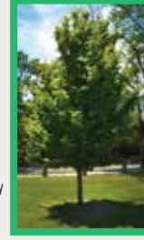
D PARROTIA ( Parrotia persica ) The (D) Parrotia is a drought-tolerant garden tree of moderate size, it is prized by connoisseurs for its striking autumn color and the exfoliating bark that develops on mature specimens.