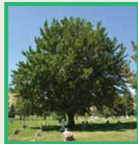
M EUROPEAN GREEN BEECH ( Fagus sylvatica ) As you approach the intersection on 325 North and 1150 East look to the north and see the largest (M) Green Beech that exists in the cemetery.