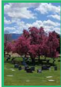
L FLOWERING CRABAPPLE ( Malus sp. ) Approaching 1100 East look right notice multiple Flowering (L) Crab Apple trees that show their glory in spring. This one is a stunning bright pink. The crabapple trees throughout the cemetery also produce fruit that is loved by the wildlife that call the cemetery their home.