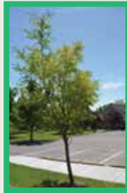
G YELLOWWOOD ( Cladrastis kentukea ) The (G) Yellowwood is a small to medium-sized deciduous tree typically growing 33-49 feet tall. The leaves are light yellow beneath.