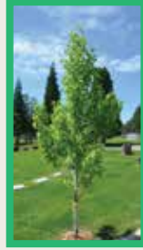
H SWEETGUM ( Liquidambar styraciflua ) The (H) Sweet Gum leaves usually have five (but sometimes three or seven) sharply pointed palmate lobes. They are 3-5 inches wide on average and have three distinct bundle scars. These trees may live up to 400 years.