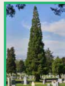
S GIANT SEQUOIA ( Sequoiadendron giganteum ) At the intersection of Center Street and 270 North make a right turn and head west down this street noticing the (S) Giant Sequoias planted on either side. These are typically pyramidal trees. Kissing cousins to the Sequoias in California.