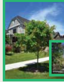
C AMERICAN SMOKE TREE ( Cotinus obovatus ) The (C) American Smoke Tree produces panicles of pink-grey flowers in summer, and its foliage turns a brilliant scarlet in autumn; considered by many to be the most intense fall color of any tree.