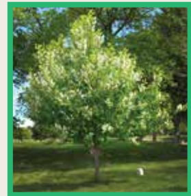
J MAY DAY TREE ( Prunus padus ) At the Christmas Box Angel monument notice the (J) May Day tree that is planted to the west. This tree has beautiful white flowers in the spring.