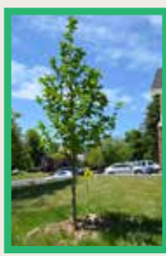
F KWANZAN FLOWERING CHERRY ( Prunus serrulata 'Kwanzan') The (F) Kwanzan Flowering Cherry is a deciduous tree that grows between 25 and 40 feet tall. In the spring it produces red buds, opening 2 inches in diameter with deep-pink double flowers.