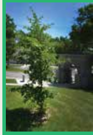
B FRINGE TREE ( Chionanthus virginicus ) The (B) Fringe Tree is a deciduous small tree growing to as much as 35 feet tall, though ordinarily less. The bark is scaly, brown tinged with red.