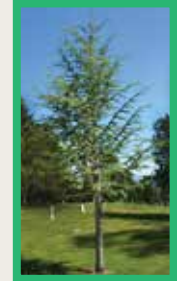
O BLUE ATLAS CEDAR ( Cedrus atlantica ) Continue west past Cyprus and notice the (O) Blue Atlas Cedars that are planted on both sides of the street. One day they will grow tall enough to create an arch over the street.