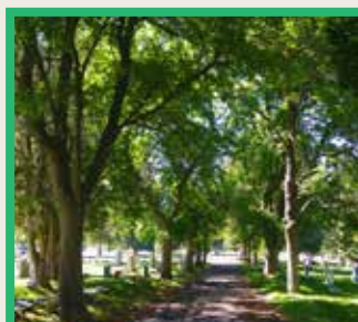
Q NORWAY MAPLE ( Acer platanoides ) At the intersection of 1000 E and 330 North look to the north and admire the mature (Q) Norway Maple trees that line this street. They are very picturesque in the summer shade and again in the fall with their yellow fall color.