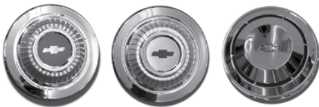
NDD-210 NDD-220 NDD-230