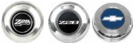
NCC-688 NCC-872 NCE-9479