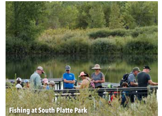
Fishing at South Platte Park