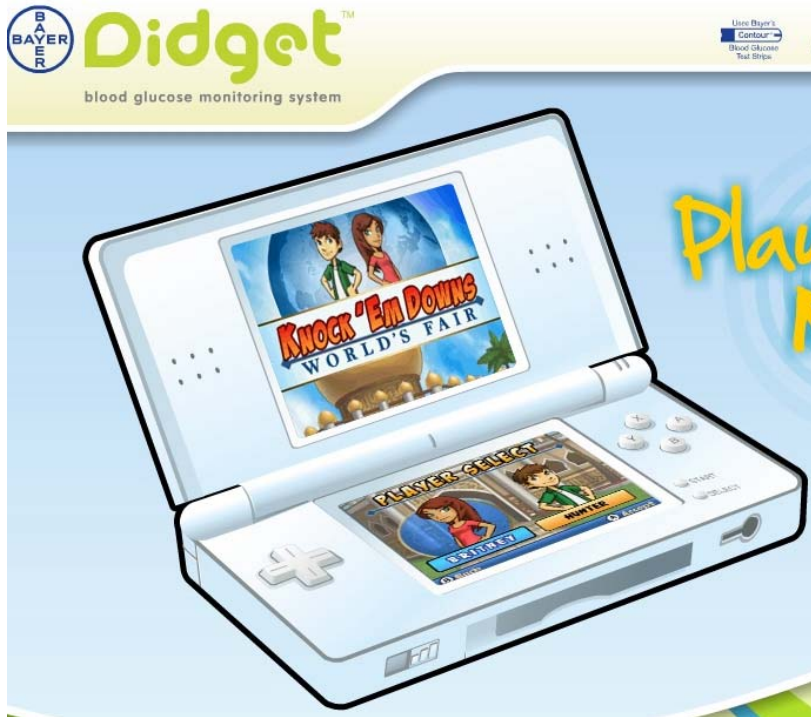
Fig. 3 The Nintendo DS with the blood sugar meter "Didget" from Bayer [33]