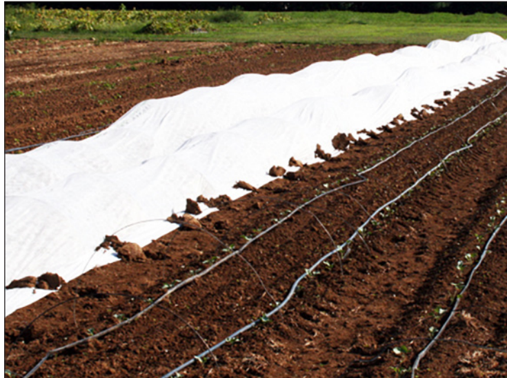
Low tunnels provide protection against frost.

Production risks occur from the uncertainties of agricultural production. Weather, insects and disease are the more common production risks incurred in fruit and vegetable production. Produce growers may spread risk out across different planting times. For example, planning an early planting to capture higher prices may incur a risk of frost, but that risk could be managed by using row