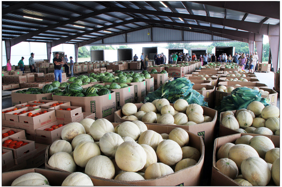
Produce auctions are an entry-level form of wholesaling in Kentucky.

PRODUCE AUCTIONS are an entry-level form of wholesaling for produce growers in Kentucky. There were five produce auctions selling in Kentucky during 2015. Produce auctions reward product quality and consistency but may also present the challenge of variable