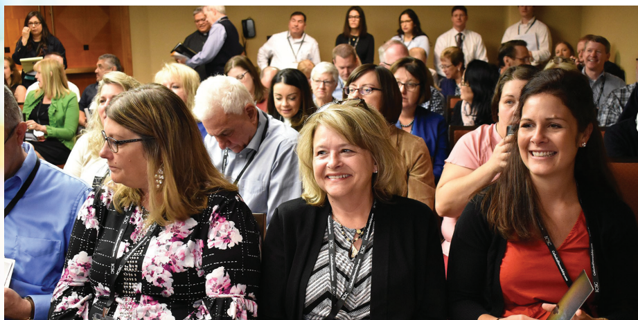
ICSC conference participants enjoying one of many networking opportunities.