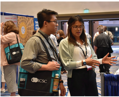
ICSC business partners offer pastors cutting edge solutions to the challenges they face.