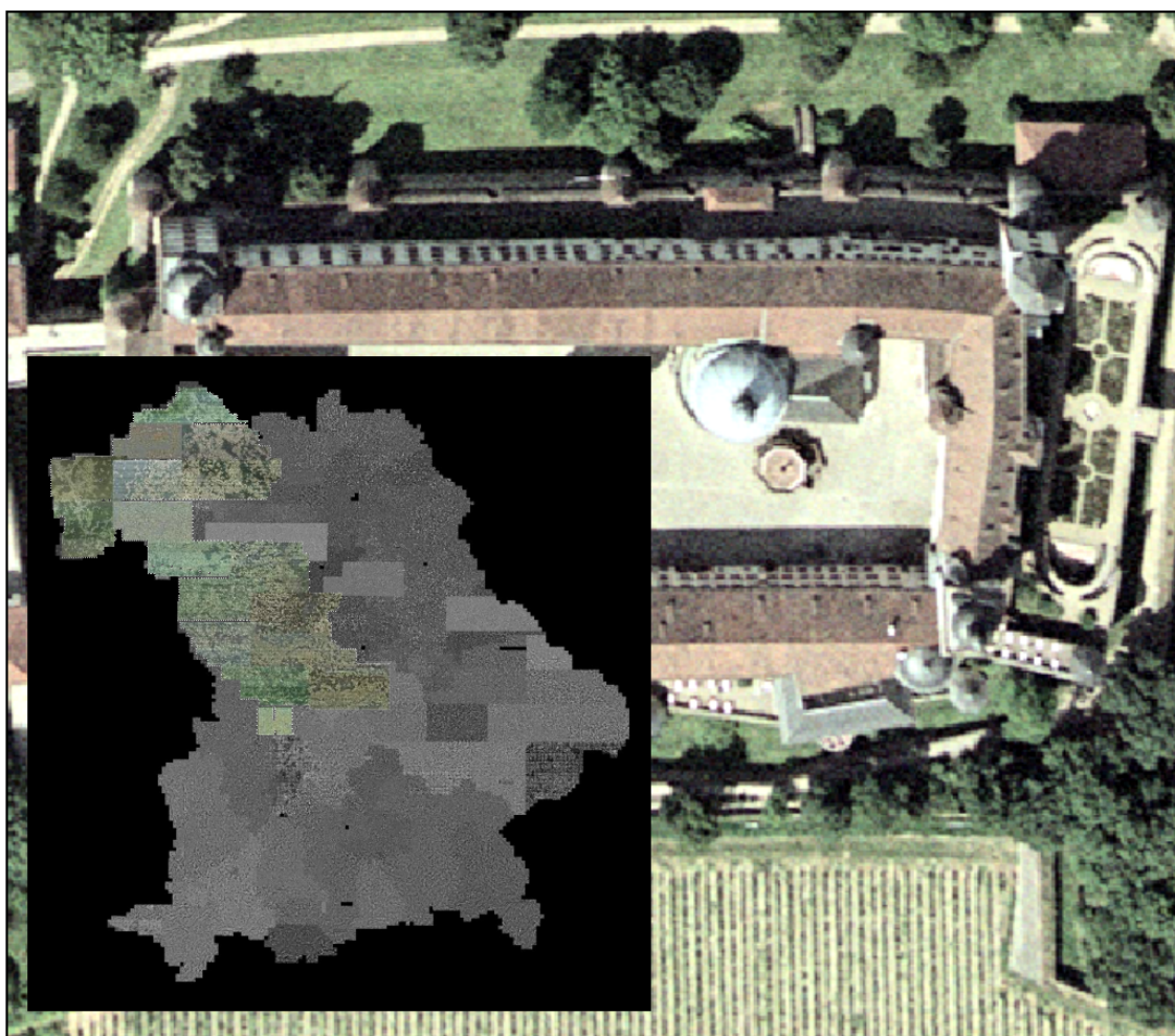
Fig. 2: Overview of (current) color and grayscale aerial image of Bavaria, and hi-res zoom.

We will demonstrate rasdaman using different tools. The query frontend, rView, allows to interactively submit n-D queries and display result sets containing 1-D to 3-D data. The specialized geographic Web interface, rasgeo, relying