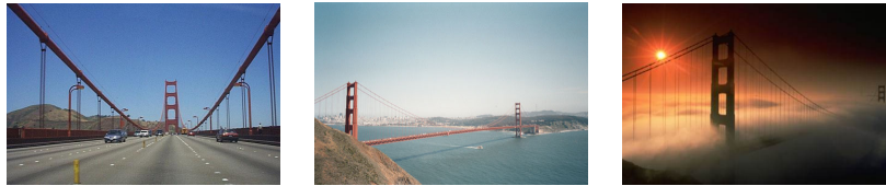
Figure 1: Visual examples of the Golden Gate bridge.

topic. Therefore, we hand-picked for each topic a single representative from the available examples and compared these manual example results to the other two result sets.