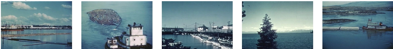
Figure 4: Top 5 results for homogeneous queries with unclear or false semantics

run4 Text + selected components from both NIST properly. and Google images.