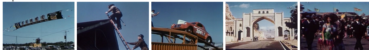
Figure 3: Top 5 results for a homogeneous query with clear semantics (‘Sky’)

specific topics like the video track topics, but it helps in gaining insight in the models performance. In future work, we will further investigate the influence of individual components on retrieval results. In addition, we intend to look at how incorporating different sources of additional information (e.g. contextual frames, the movement in video or user interaction) can help improve results across collections. Combining multiple examples in one query is still problematic, but combining textual and visual runs seems possible using the presented framework. When one of the runs is poor, a combined run, including the noise, is less effective than the single best run. However, when the individual runs have reasonable scores, combining them improves retrieval effectiveness.