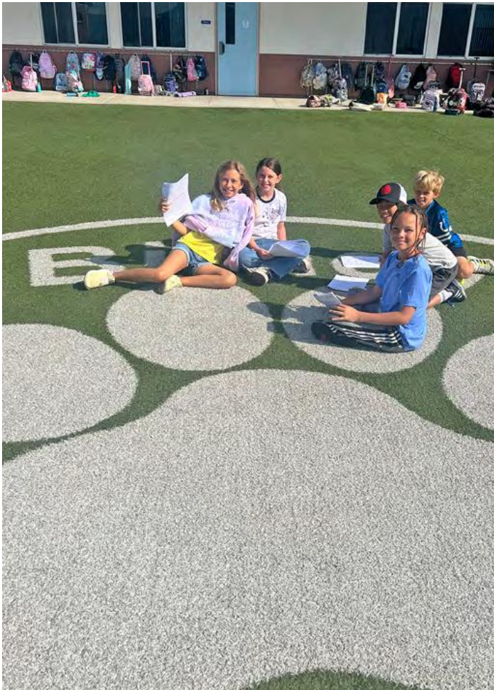
Readers Theater - Fourth grade students are hard at work reading their scripts for their Readers Theater Performance. Readers Theater is a fun way to engage students in repeated reading, which is an academic practice that increases oral reading fluency and comprehension.