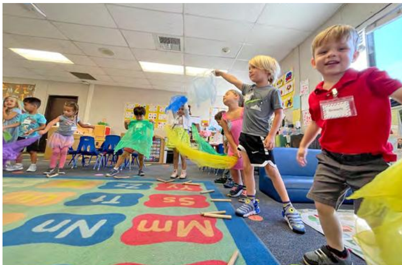
Music is fun with scarfs.

As you and your child listen to various pieces of music, talk to them about it. Discuss the distinctions between the sounds of each instrument, and then ask them about their preference for soft, low, or loud sounds. Early exposure to a wide variety of music will ensure your child's acceptance and appreciation of music for a lifetime, and we start this in preschool!