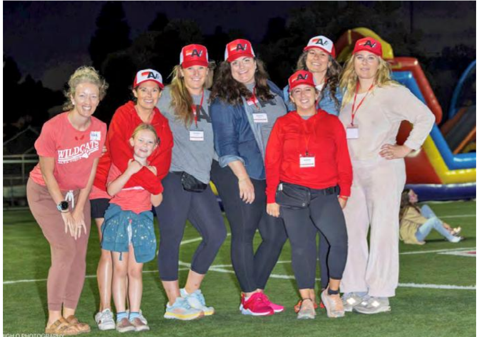
Some Alta Vista Nation members enjoying the evening.

Let's keep the spirit of togetherness and joy alive throughout the school year. I am looking forward to more memorable moments with all of you. Wishing you a beautiful season ahead.