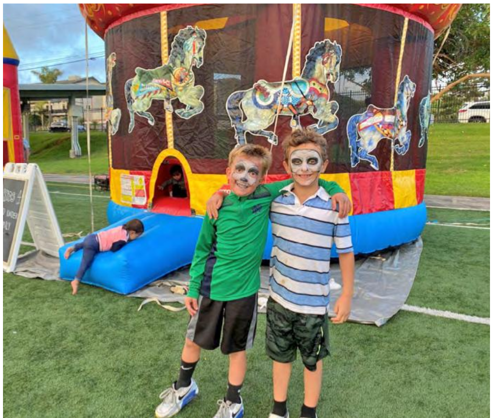
Alta Vista students hanging out at the carnival.