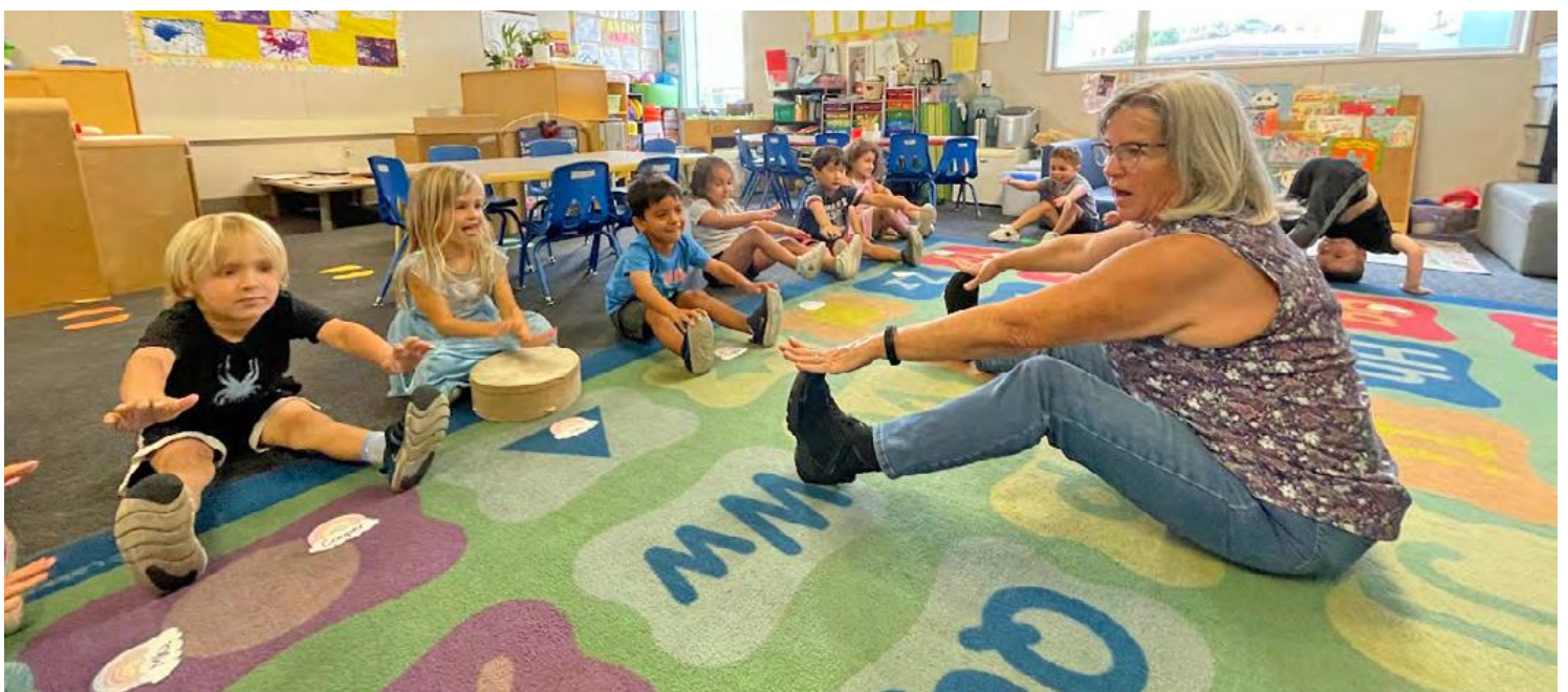
Musical Name Game.