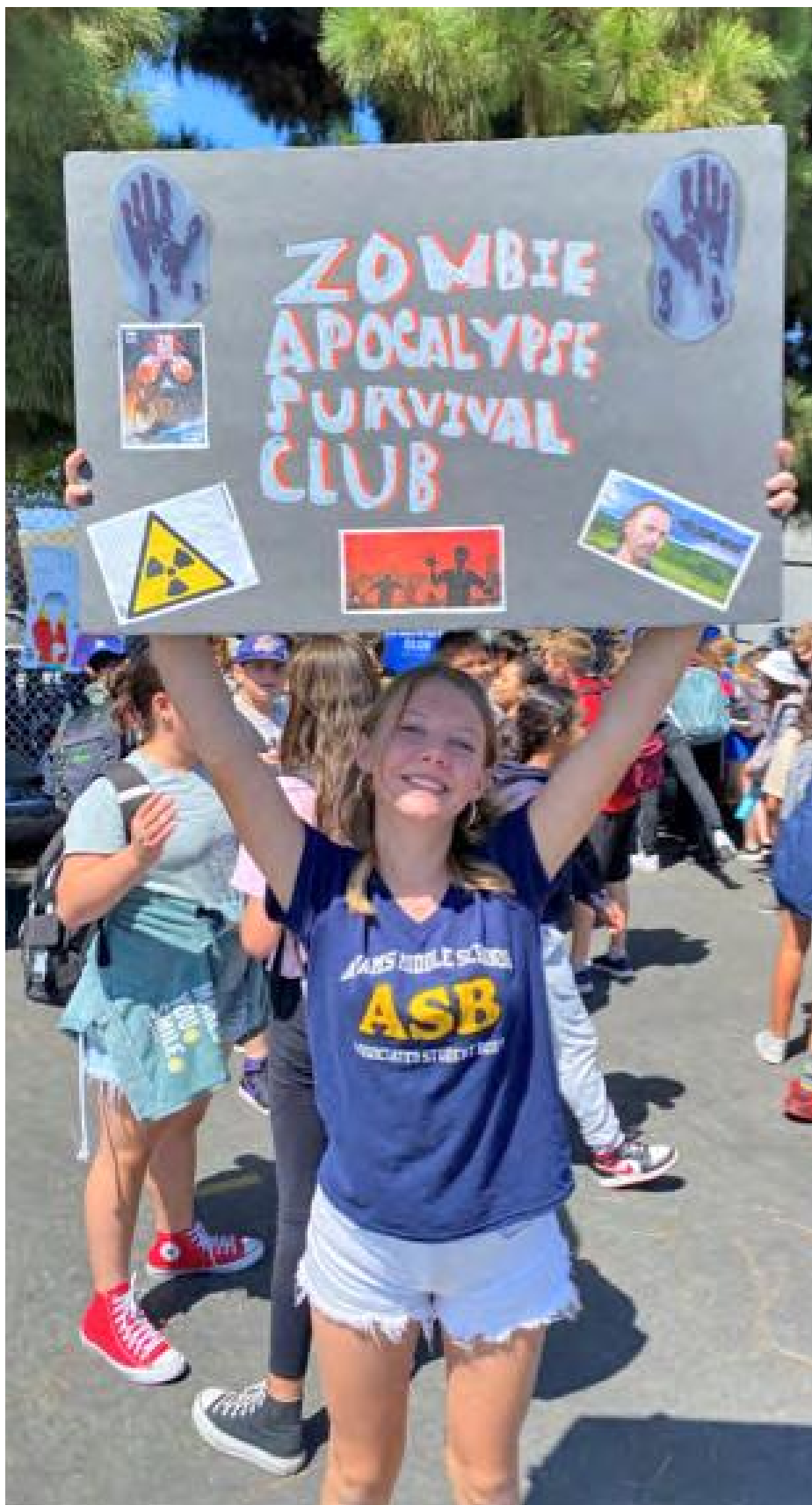
ASB promotes Club Rush during lunch.

We encourage visitors, parents, and others in the community to ask our students, “How are you connected at Adams?” Their answers will make you smile!