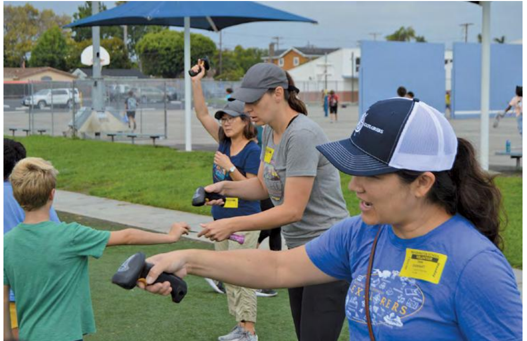
Our fabulous parents helping to track our students' laps.