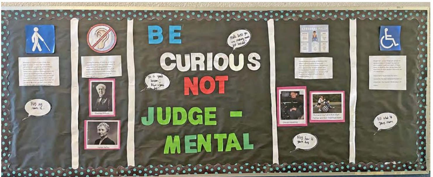
Student leaders encourage their peers to approach our differences with curiosity.