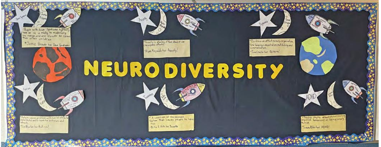
Student leaders educated their peers on neurodiversity through lessons and a bulletin board for Inclusion Week.

Week, student leadership groups called on all students to engage in acts of kindness to help promote a more inclusive environment. They also educated their peers through lessons and bulletin boards on neurodiversity, cultural inclusion, and being “curious not judgemental” about our differences. Our focus on kindness also included teacher-led lessons on being an upstander in instances of hate or bullying. Being an upstander means recognizing unfair treatment of others, speaking up to stop the behavior, and reaching out for support when needed. When we highlight the value of kindness and give students tools to stand up for kindness, we are nurturing the compassionate leaders of tomorrow.