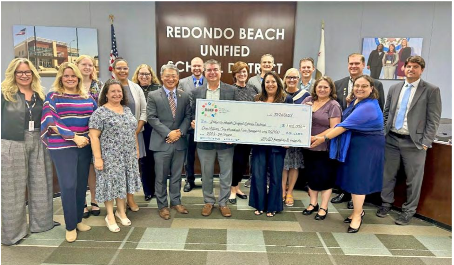
RBEF Board of Trustees presents $1,105,000 check to RBUSD for the 2023/24 School Year.

This 2023-24 School year, the Redondo Beach Educational Foundation is proud to grant a historic $1,105,000 to the Redondo Beach Unified School District to support the educational journeys of all our students. We thank you all for your generous support throughout the year because your investment in RBEF is really what helps ignite the spark that sets our students up for a lifetime.