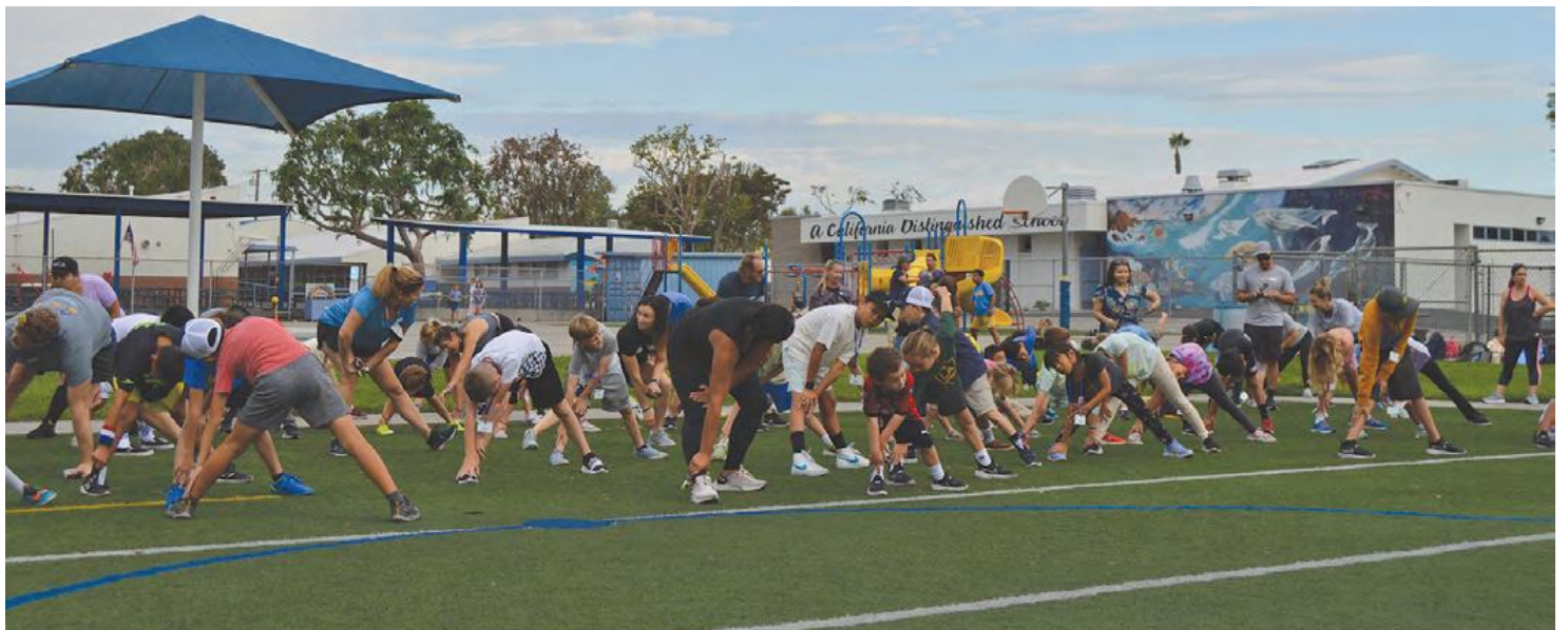
Our runners doing our Washington Stretch.