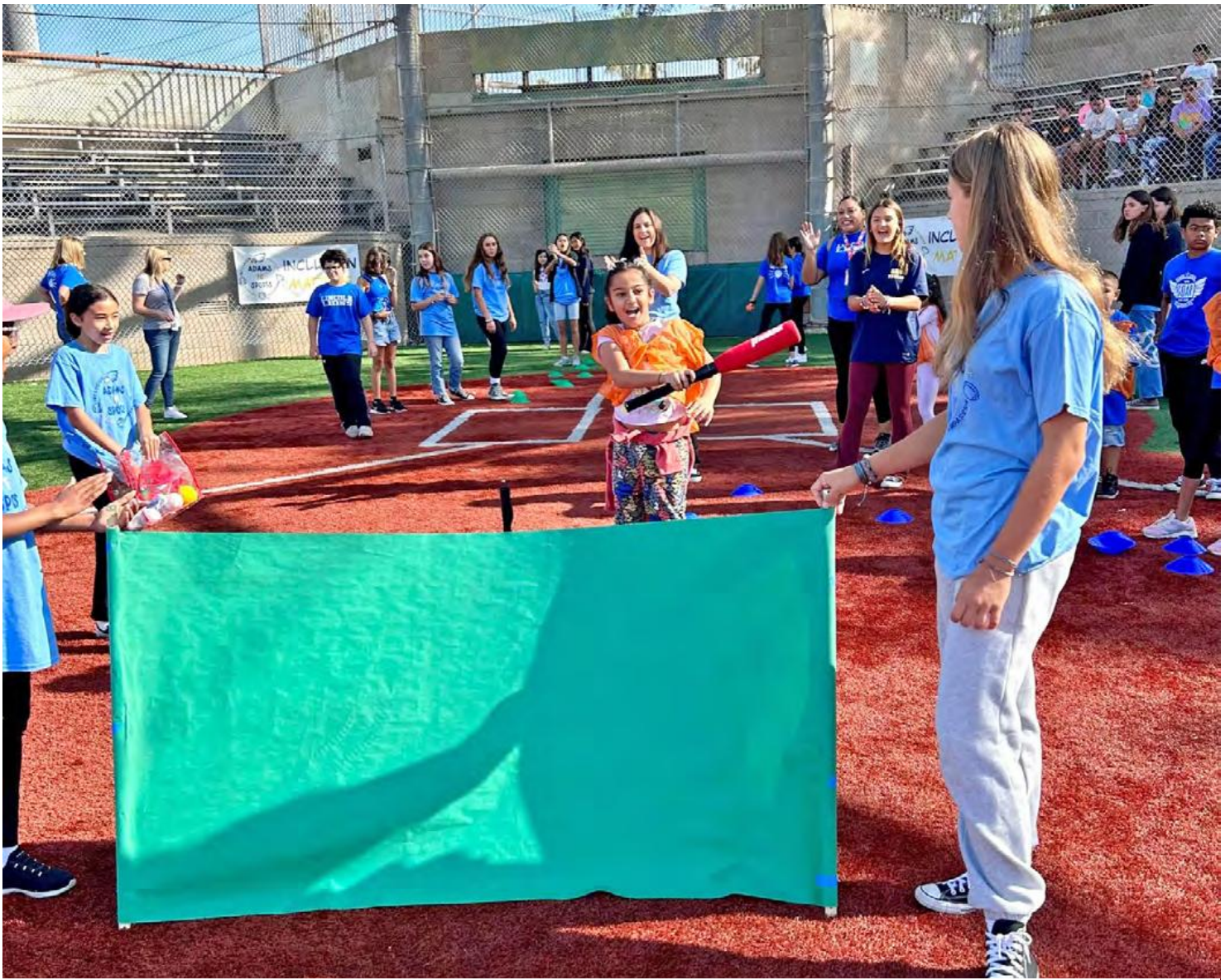
A Lincoln 2nd grade student athlete celebrates a home run!