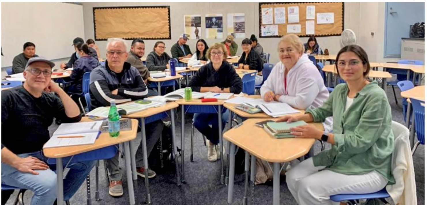
Several Spanish speaking countries, Russia, Ukraine, Turkey, Iran, Brazil, Vietnam, and Italy are all represented in this High Intermediate English as a Second Language course.