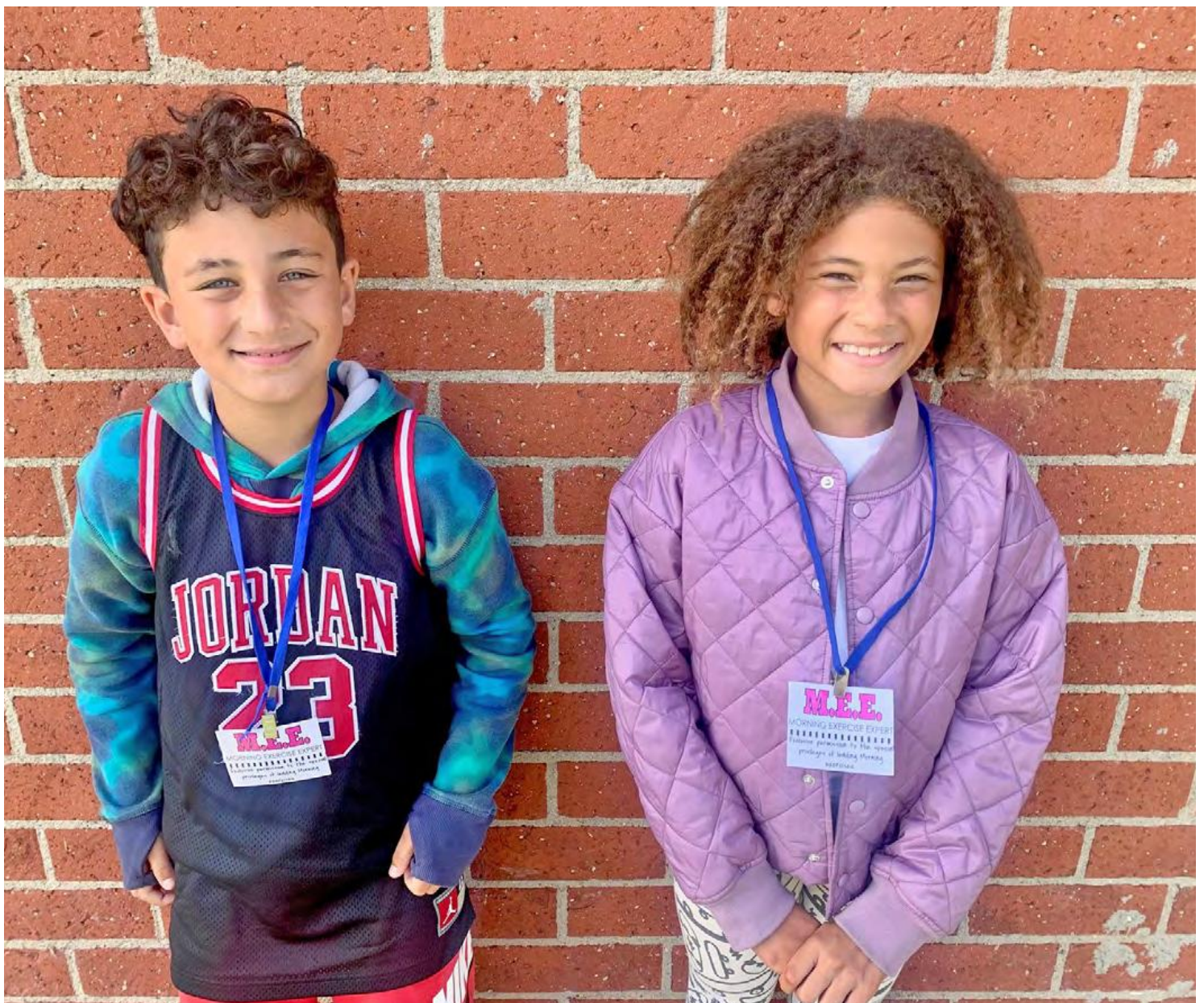
This week's 3rd grade Morning Exercise Experts (M.E.E.).

These leaders have helped re-shape the Tulita school community. For 8 minutes each morning, our school moves as one. Morning Exercises have brought our students together and our Morning Exercise Experts give us a perfect opportunity to highlight the positivity and hard work of our Tidalwaves. There's no better way to start our school day and get our students' mindsets ready for academic success!