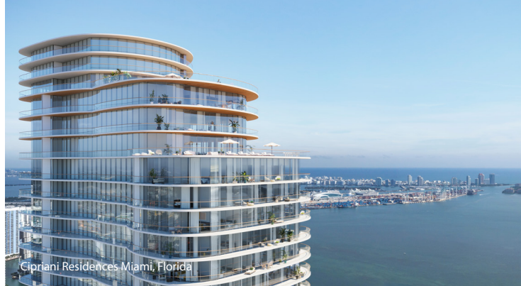
Cipriani Residences Miami, Florida