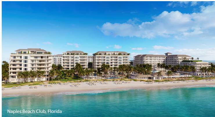
Naples Beach Club, Florida