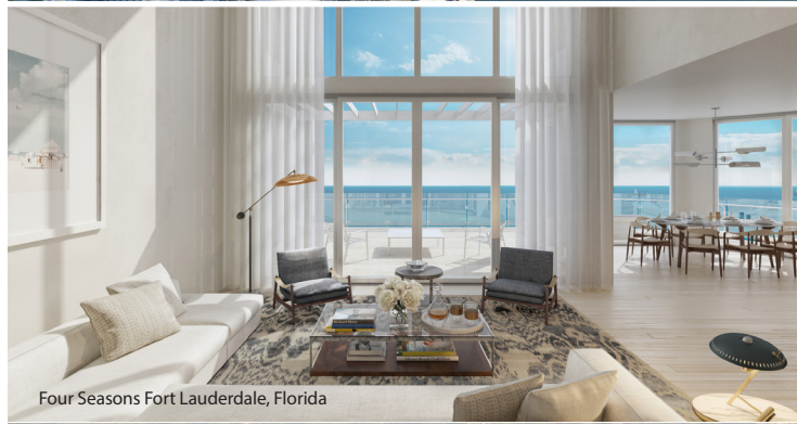
Four Seasons Fort Lauderdale, Florida