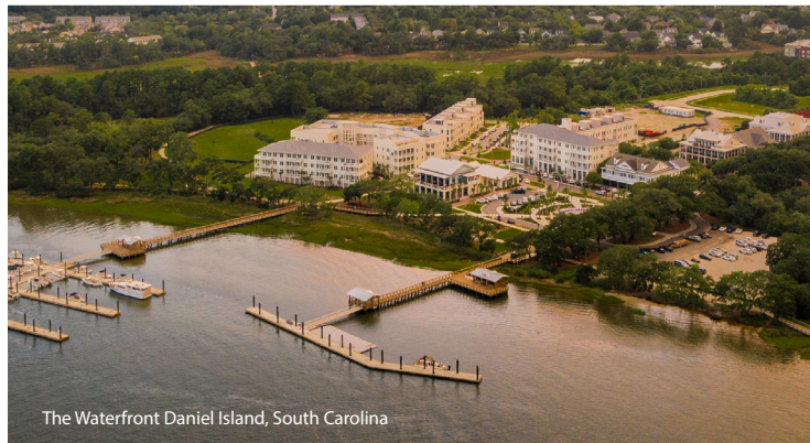
The Waterfront Daniel Island, South Carolina