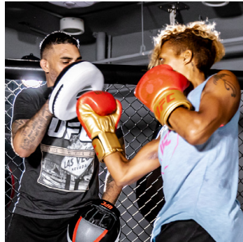
Designed for Versatility Ideal for Sparring, Clinching, and Bag Work