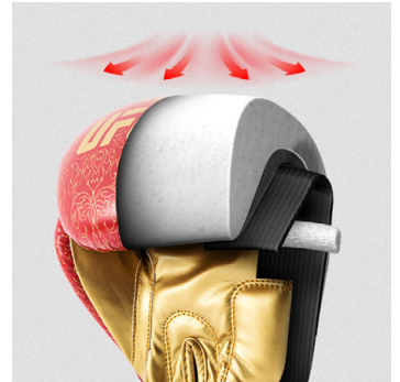
3D Reaction™ Foam Superior Shock Absorption and Explosive Power