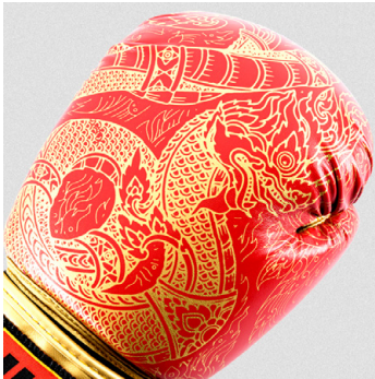
Harness the Spirit of the Dragon Bold Naga Design Symbolizing Strength and Power

Strapping up with the UFC Naga Training Gloves is a statement of dedication, resilience, and an unrelenting drive to conquer every challenge. Inspired by the ferocity of the Naga dragon and designed with cutting-edge materials and technology, these gloves empower you to push beyond limits and achieve your ultimate potential. Step into the gym with confidence, train with intensity, and embody the spirit of the Naga.