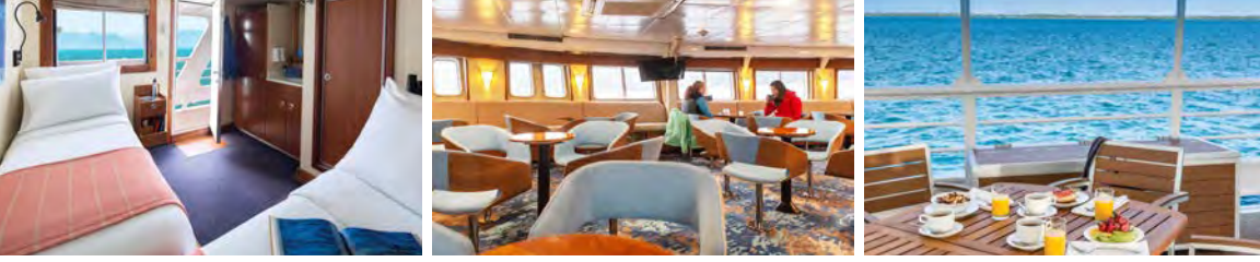
From left: Category 2 cabin with single beds; the lounge is the center of life aboard ship; the sundeck is a perfect place to relax and observe the scenery.