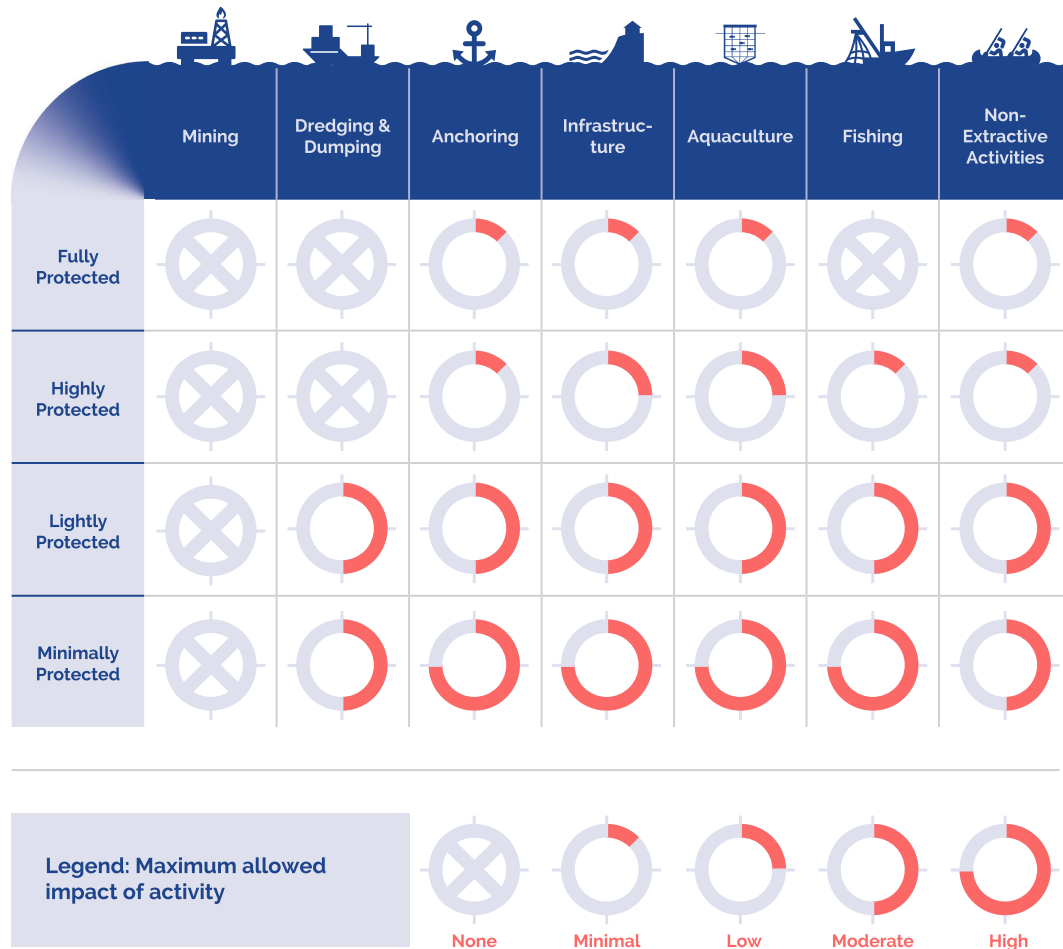
Fig. 1. Level of protection based on maximum allowed impact of seven potential activities in MPAs. An MPA or MPA zone can be categorized into one of four LEVELS of protection: Fully, Highly, Lightly, or Minimally, on the basis of seven types of activities and their impacts (a decision tree approach is available in fig. S2). Dials indicate the scale of impact that may be occurring at a given protection level: none, minimal, low, moderate, or high/large. If impacts are high/large, the

duration, and frequency relative to biodiversity conservation goals and is described as “none,” “low,” “moderate,” “high/large,” or “incompatible with biodiversity conservation” (Fig. 1 and fig. S2). Using this impact scale, a LEVEL of protection can be assigned for any given MPA or zone regardless of location, species, or circumstances. Impacts of certain activities may scale differently considering specific features of an MPA or zone, such as size; for example, distribution of an activity across areas of different sizes may render it high impact in a smaller MPA but moderate impact in a larger MPA. Incompatible activities include industrial extraction such as industrial fishing (for example, vessels > 12 m using towed or dragged gears), oil and gas exploration, mining, or other extremely impactful activities such as fishing with dynamite or poison (supplementary materials, LEVELS Expanded Guidance,