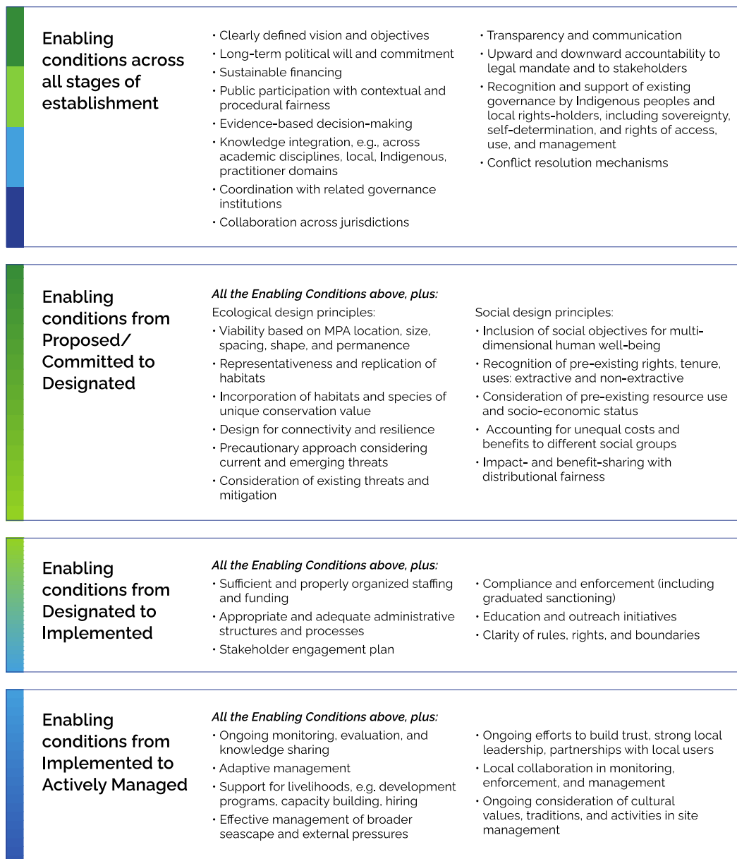
Table 1. Enabling conditions for effective MPAs. These CONDITIONS may vary in their importance during the process of achieving each of the four STAGES.

practices give voice to those who often disproportionately bear the costs of degradation or conservation and identify livelihood support or other strategies to help mitigate impacts and increase benefits. For example, MPAs in the Mediterranean received greater support from community members with transparent decision-making that recognized and strengthened the rights of local resource users (66). MPAs that exclude resource users from decision-making and ignore their rights and livelihood dependencies can erode their well-being and undermine compliance. In Mnazi-Bay, Tanzania, exclusion of resource users from