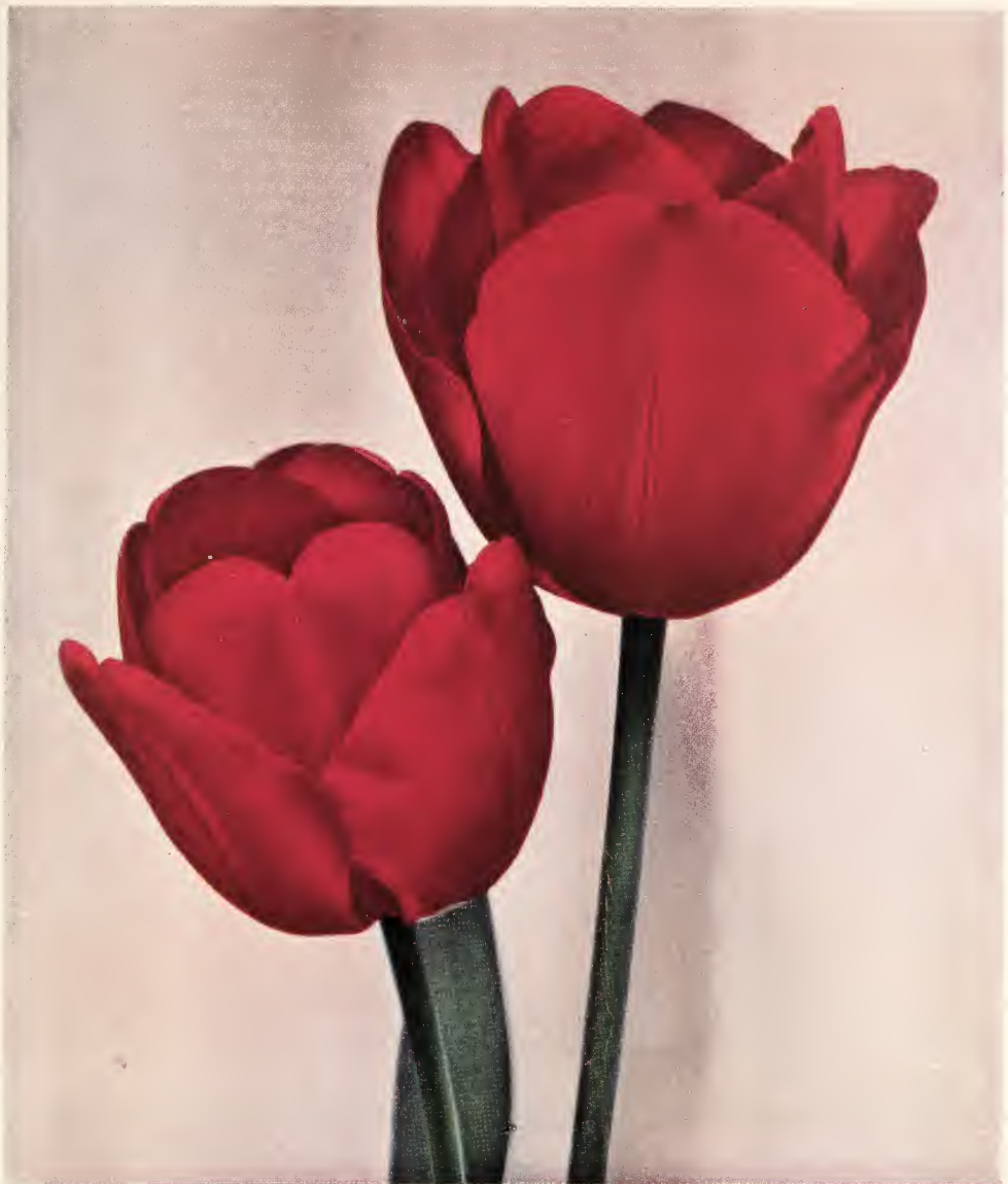
PRIDE OF HAARLEM