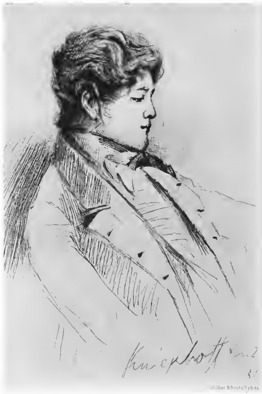
Otto von Bismarck in 1834, from a Drawing in the possession of the Family