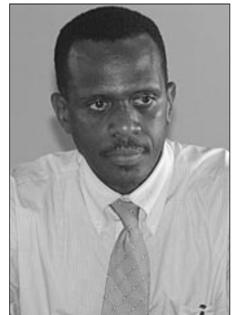
East Castries Parliamentary Representative Hon. Philip J. Pierre

PROUD was established in April 2000 to address issues related to housing congestion resulting from squatting on government owned lands, and is an integral part of the Government's shelter development and land reform programme. Residents of thirteen communities throughout the island have benefited from interventions by PROUD.