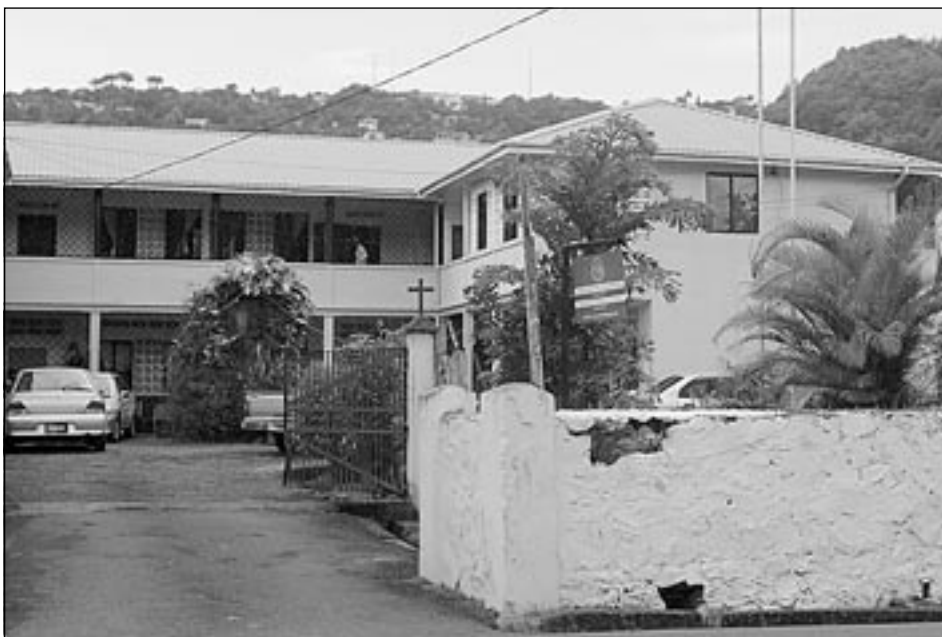
The privately run Marian Home

The finances of CARE come from the students who pay $200 per term, benevolent benefactors and Government. Mr. Speaker, in recognition of the excellent work being undertaken by CARE, I propose to increase their subvention by $100,000 to $300,000.