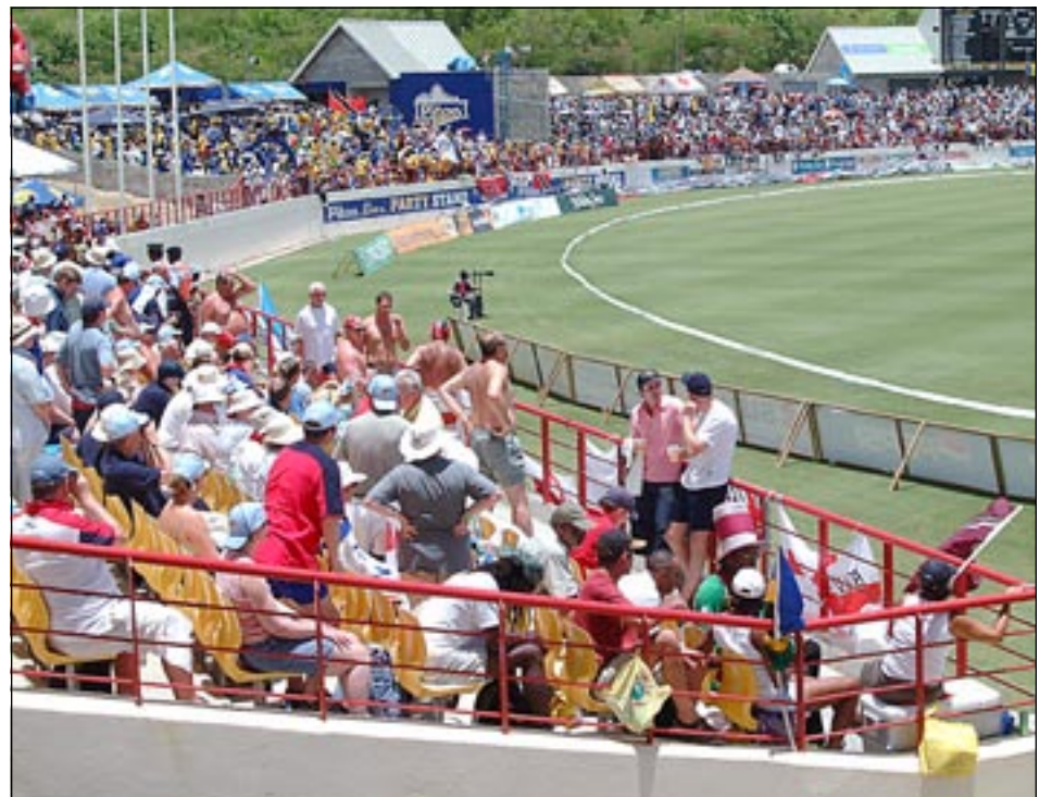
A section of the Beausejour Cricket Ground

Interestingly enough, the Test match comes at the end of the IX Venue Summit organised here by the Cricket World Cup West Indies to assess, with the International cricket Council, the state of readiness of the venues to be used for next year's World Cup as well as to evaluate the work being undertaken by the Local Organizing Committees in the territories hosting the games in CWC 2007. According to reports, St. Lucia's Beausejour Cricket Ground continues to receive high marks and so, it is on