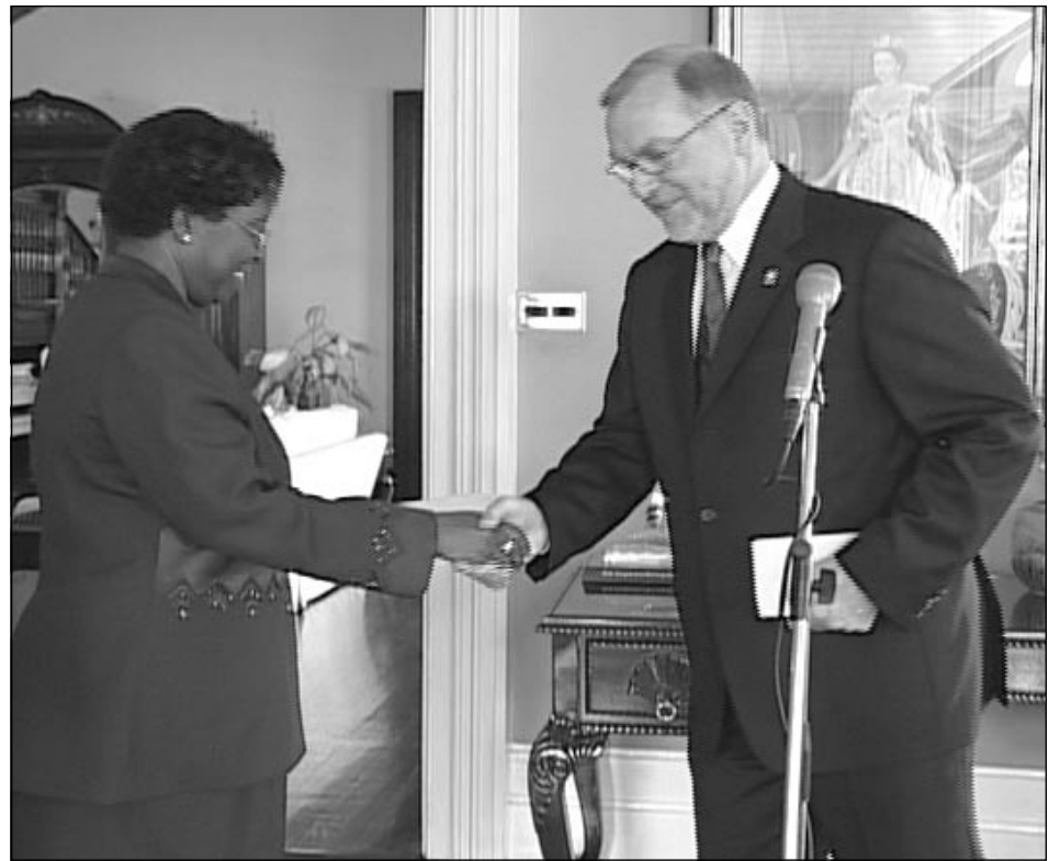
Dame Pearllette Louisy welcomes Ambassador Walter Suter

In establishing diplomatic relations with your country, we are mindful of your foreign policy objectives which embrace, among others, the peaceful co-existence of nations, respect for human rights, democracy and the rule