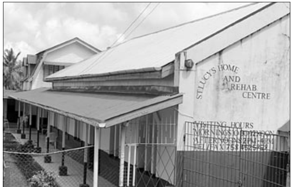
St. Lucy's Home

The cost of the new Senior Citizens' Home is estimated at approximately EC$ 13.5 million. In this financial year, a sum of $8.6 million is allocated for the commencement of construction. The project is expected to be completed within two years.