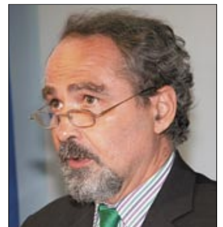
Non-State Actors Panel for EDF - page 7