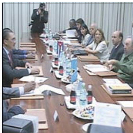
The Prime Minister in Cuba - Page 4 & 5