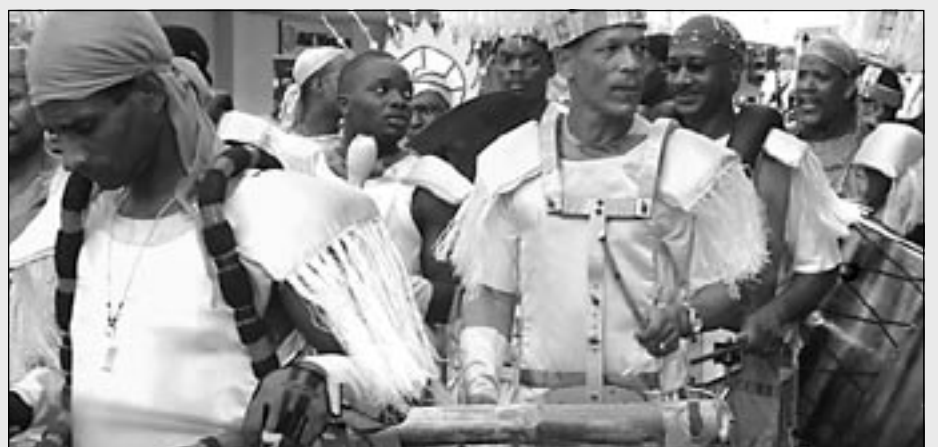
2005 Carnival Band