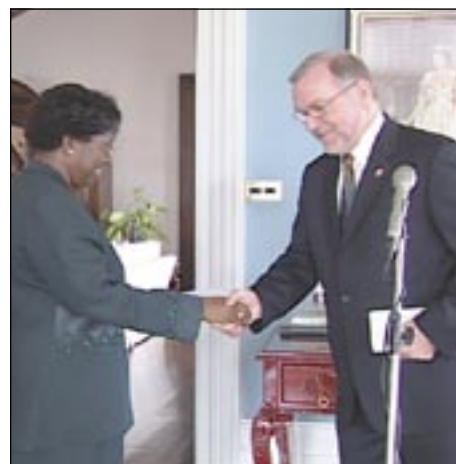
First Swiss Ambassador to Saint Lucia - Page 6