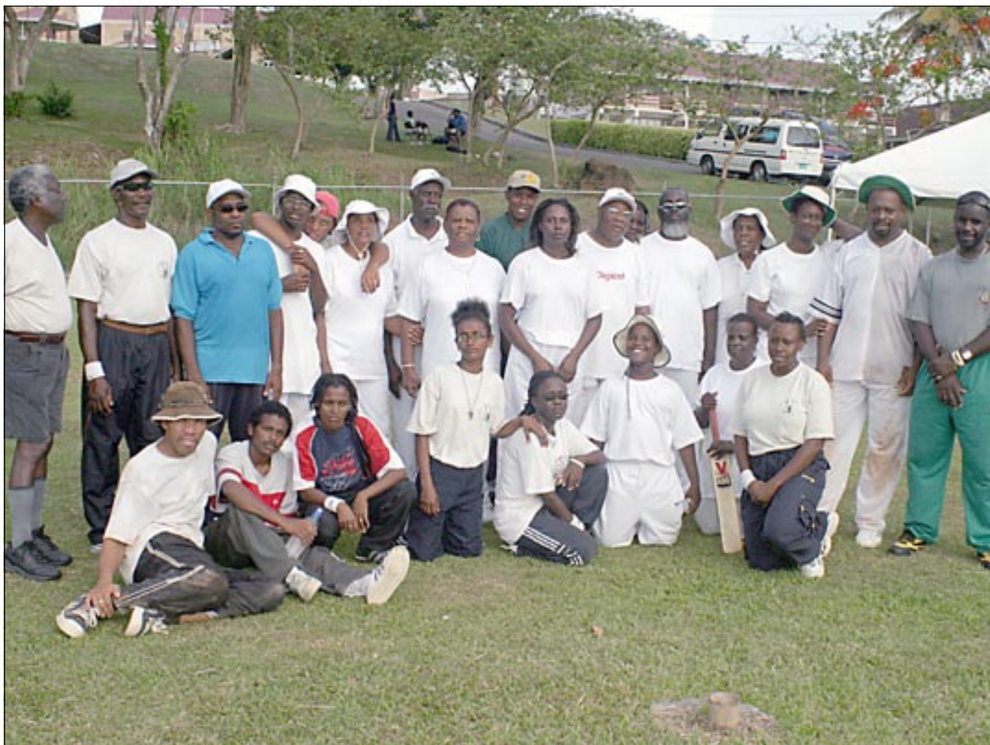
Windward Islands Blind Cricket Team made up of Saint Lucians and Dominicans

The spotlight shifted to blind cricket over the weekend with the inauguration of the Windward Islands Cricket and Sports Association of and for People with Impaired Vision on Saturday, June 03rd.