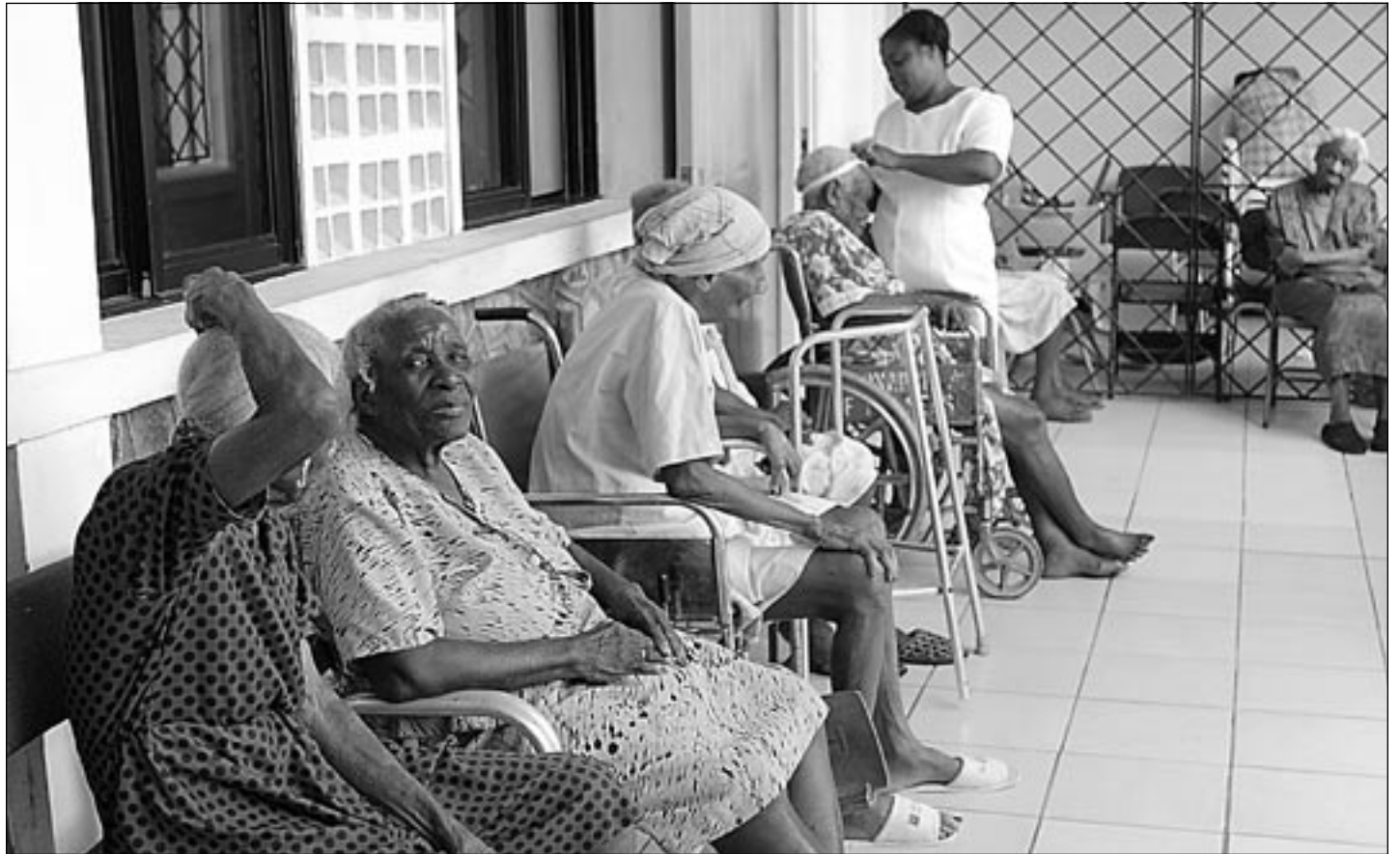
Senior citizens at one of the homes for the elderly

In order to satisfy itself that it obtained the best possible price for the land, the Government commissioned five valuations of the property, four of which came from the private sector. In the end, the Government agreed to sell