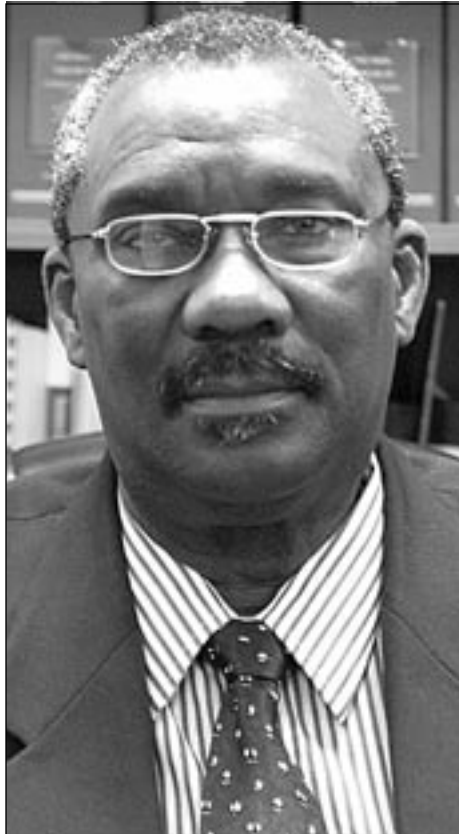
Hon. Senator Calixte George Minister for Home Affairs and Internal Security