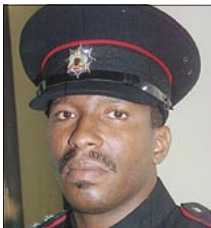
A New Fire Chief Appointed - page 2