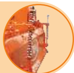
Spring loaded reinforced trailing board

Note: The details given in this guideline are just for the sake of information. The manufacturer can change the design of the machine or its any part as per his suitability.