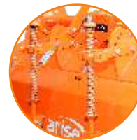
Rear Board Spring