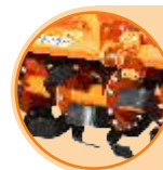
High Quality Japan Blades