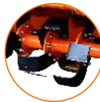
High Quality Japan Blades