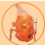
Double layer protection skid