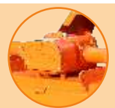
Strong Multi-Speed Gear Box

Note: The details given in this guideline are just for the sake of information. The manufacturer can change the design of the machine or its any part as per his suitability.