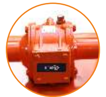
Single-Speed Gear Box