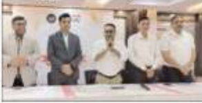
University officials pose this information during a press conference here.

Arka Jain University, which has made its mark across the country for quality higher education, has been enthusiastically striving towards building a better future for its students for the last 6 years. The happy news of this is that Arka Jain University has received Grade "A" recognition from the National Assessment and Accreditation Council (NAAC), a body of the Ministry of Education, in the very beginning of its journey, which is an indicator of credibility and quality of higher education. It will prove to be the biggest step and milestone