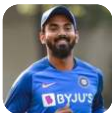
K. L. RAHUL