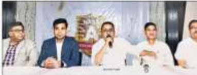
नैक से ए ग्रेड मिला को जामशेदपुर के अरका जैन विवि के सदस्य। • जामशेदपुर

जामशेदपुर, प्रमुख संवाददाता। अरका जैन विश्वविद्यालय ने एकेडमिक क्षेत्र में जामशेदपुर के नाम एक उत्कृष्ट योगदान दिया है। यह विश्वविद्यालय जामशेदपुर में नई, बेहतर शिक्षा व संसाधन का पहला ऐसा निजी विवि बन गया है, जिसे नैक से ए ग्रेड मिला है। नैक से ए ग्रेड मिला 2023 में दिए गए विश्वविद्यालय के निरीक्षण के बाद अरका जैन विवि को 3.15 की सीजीपीए अंक प्रदान किए, जिससे विश्वविद्यालय को ए ग्रेड मिला है।