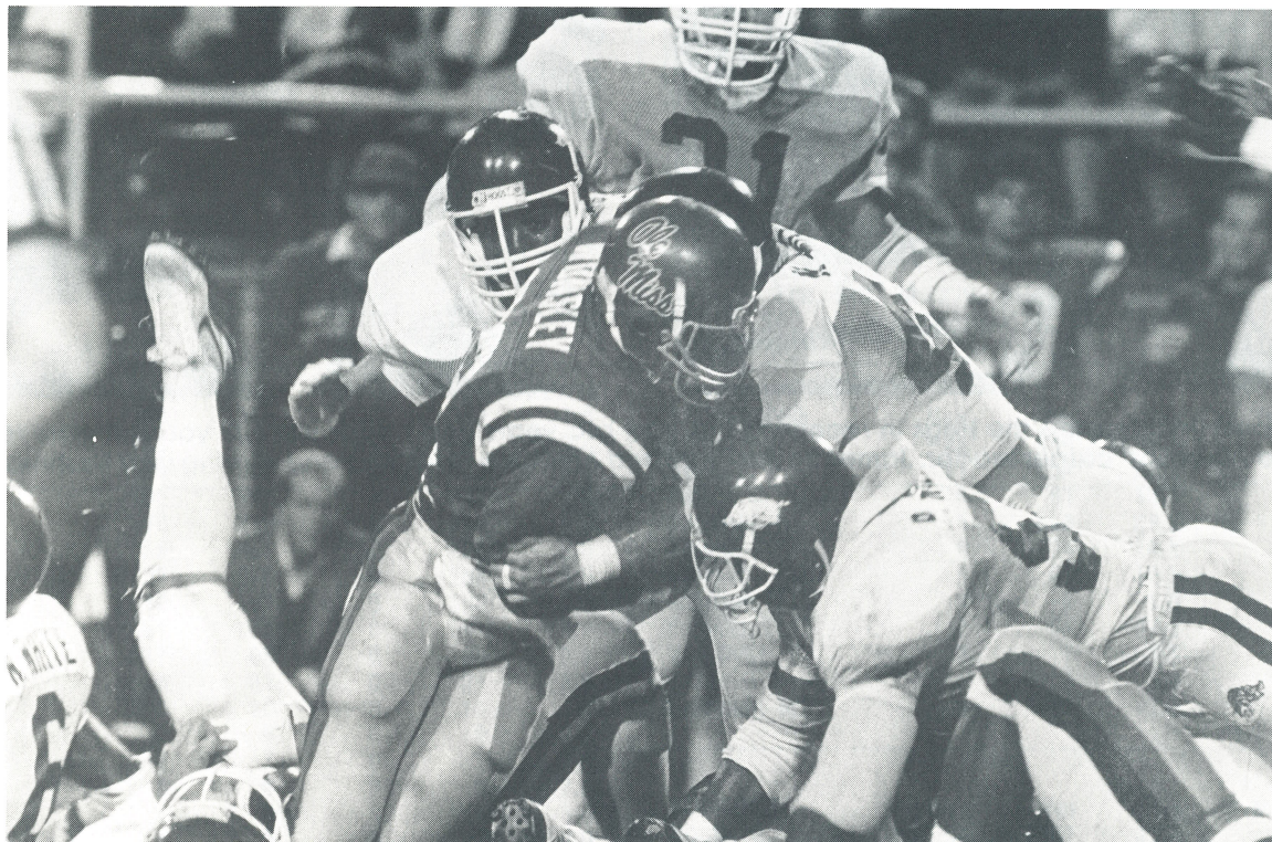
Arkansas' defense saves the victory over Ole Miss by halting this fourth-and-one play in the final quarter.