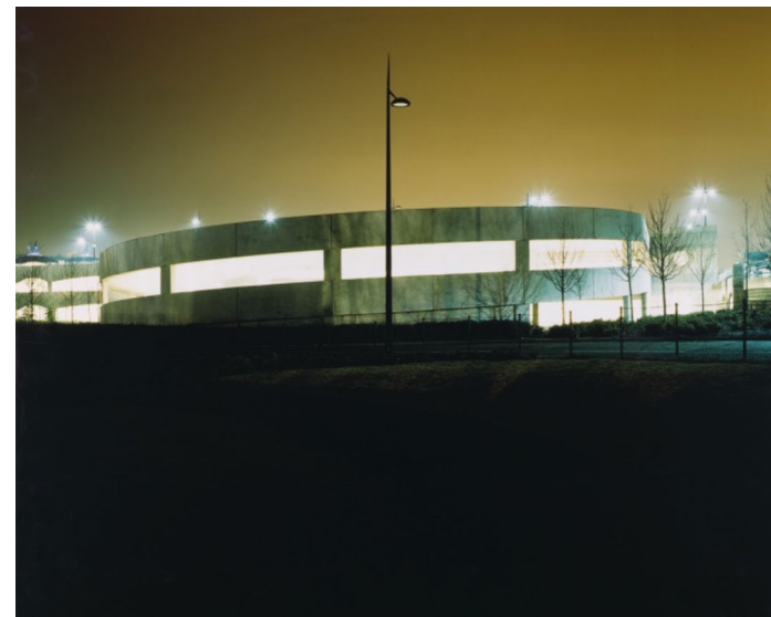
‘Untitled (A Machine for Living),’ C-type photograph on aluminium, 2000 by Dan Holdsworth

Without even thinking about it, I'm doing something similar in this work, taking a very ordinary scene and, through photographic processes, heightening it into something else.