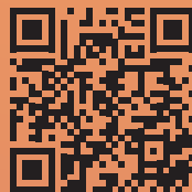
Art & Design webpage