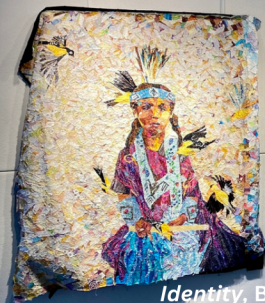
Identity, Blair Treuer (2023)

1800 West Old Shakopee Road Bloomington Center for the Arts 2nd Floor