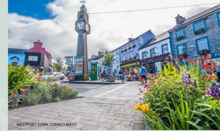
WESTPORT TOWN, COUNTY MAYO