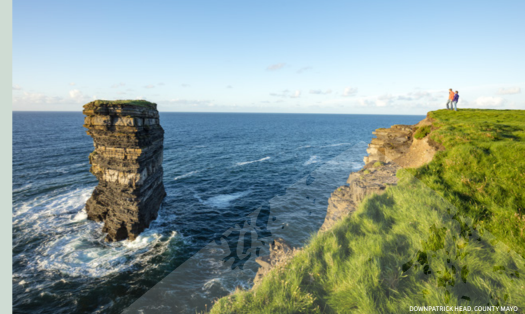
DOWNPATRICK HEAD, COUNTY MAYO

'Turk' is a hugely popular destination both with visitors from nearby counties in the West of Ireland and from further afield. It is no surprise that people feel the need to return to 'Turk'. It has that charm that allows