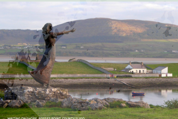
WAITING ON SHORE, ROSSES POINT, COUNTY SLIGO