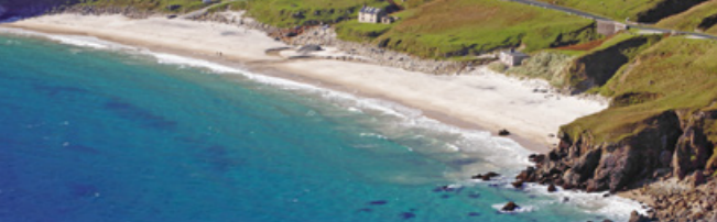
KEEM BAY, ACHILL ISLAND, COUNTY MAYO

FI-91238-SOMO-0819. Map © Fáilte Ireland 2019. Fáilte Ireland accepts no responsibility for any errors or omissions contained within this map. Map design www.speardesign.ie . Original map data sourced March 2018 © OpenStreetMap.org. For feedback, please contact – visitors@faillieireland.ie