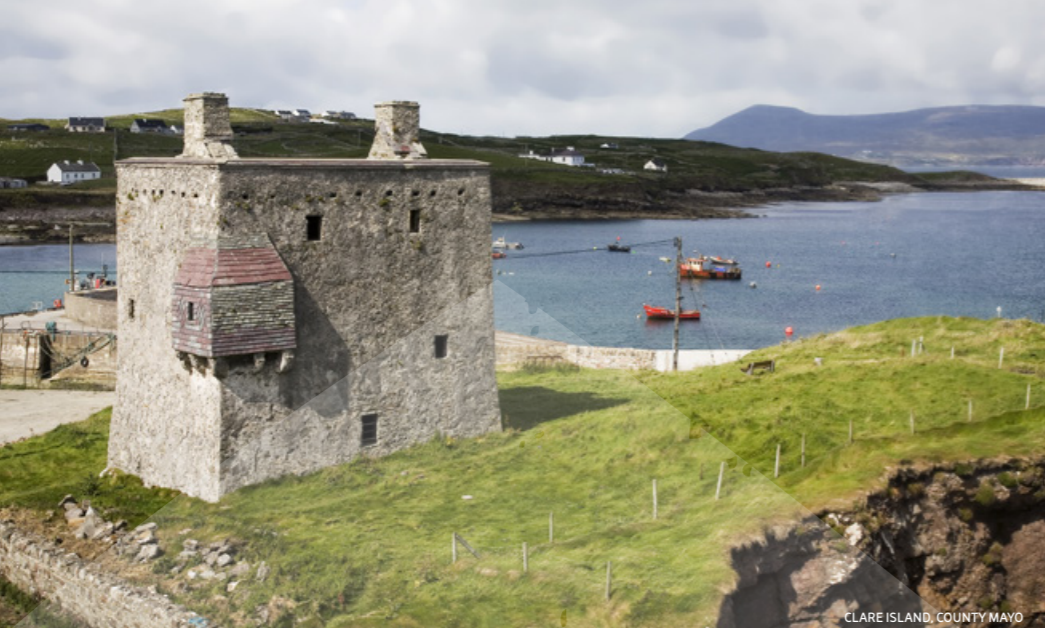
CLARE ISLAND, COUNTY MAYO

For a full listing of all there is to see and do in the area including angling, cycling, equestrian, gardens, golf, walking and more – please visit www.WildAtlanticWay.com