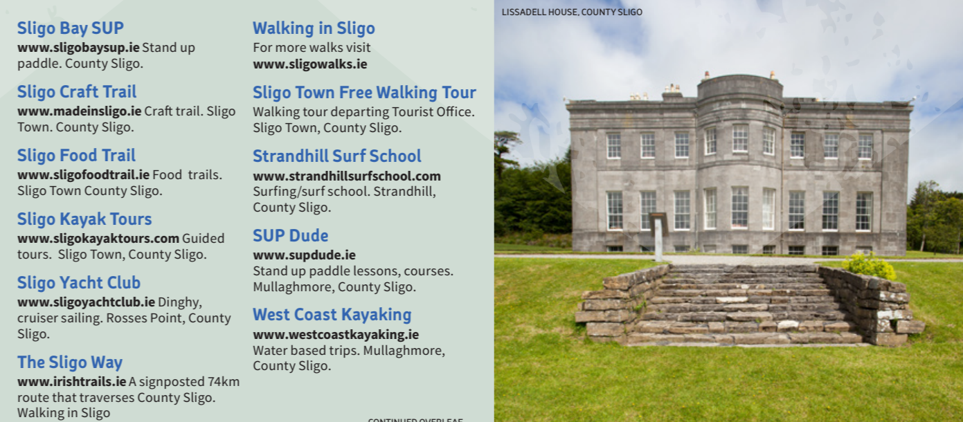
LISSADELL HOUSE, COUNTY SLIGO