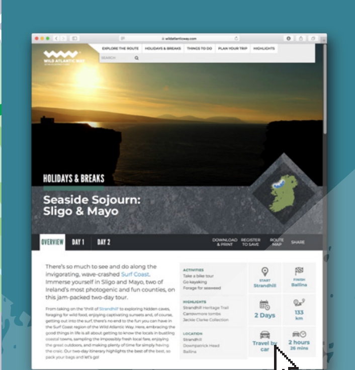
WILD ATLANTIC WAY WEBSITE

The Yeats Memorial Building was gifted to the Yeats Society by Allied Irish Banks in 1973 and hosts permanent exhibitions relating to the life and works of Yeats. Every year the Yeats International School is held in July along with the Tread Softly Festival.