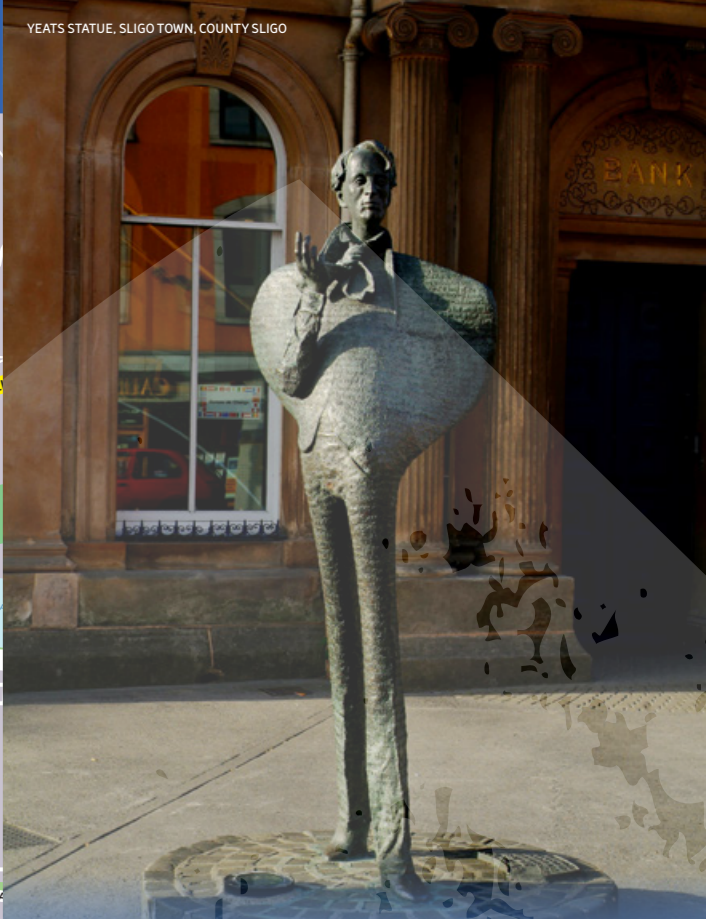
YEATS STATUE, SLIGO TOWN, COUNTY SLIGO