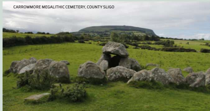
CARROWMORE MEGALITHIC CEMETERY, COUNTY SLIGO