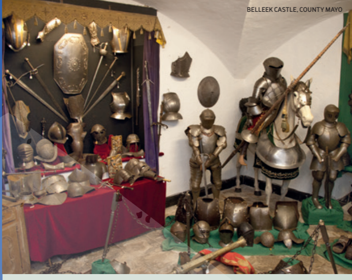
BELLEEK CASTLE, COUNTY MAYO

In Westport, you can enjoy a variety of activities, historical walking tours, cruises, relaxing spa treatments or be entertained at the Town Hall Theatre.