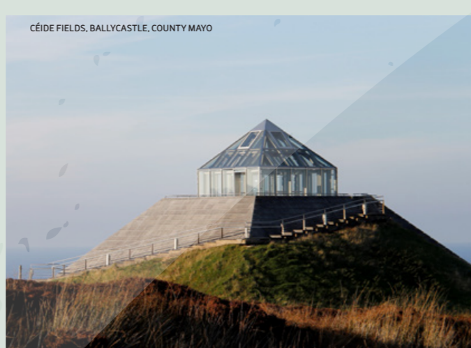
CÉIDE FIELDS, BALLYCASTLE, COUNTY MAYO