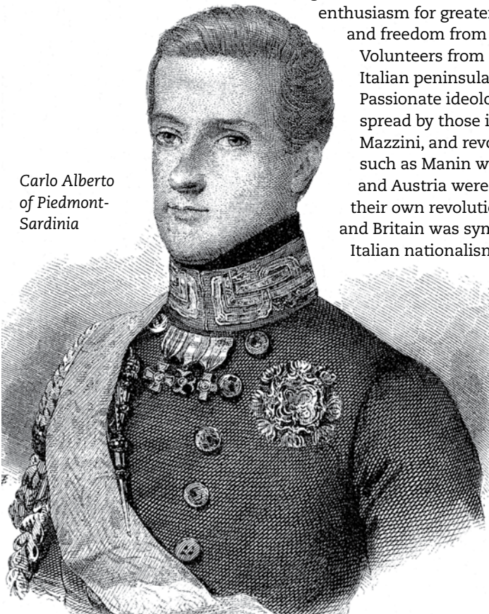
Carlo Alberto of Piedmont- Sardinia

Volunteers from different parts of the Italian peninsula came to the north. Passionate ideological feeling was spread by those influenced by Mazzini, and revolutionary leaders such as Manin were emerging. France and Austria were too distracted by their own revolutions to intervene, and Britain was sympathetic to Italian nationalism.