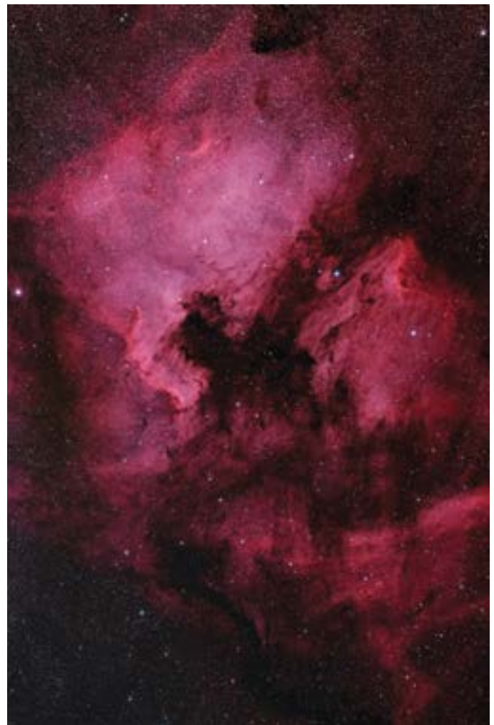
▲ BUTTERFLY WINGS Top : Emission nebula IC 1318 (left) is divided by a thick dust lane into two fairly symmetrical “wings”.