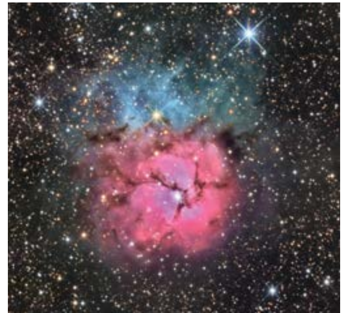
▲ HOST WITH THE MOST The opaque lanes of Barnard 85 give M20, the Trifid Nebula, its memorable name.

Another emission nebula subdivided by dark nebulae is IC 1318 , sometimes called the Butterfly Nebula. The glowing wings of this celestial insect span the 2° directly east