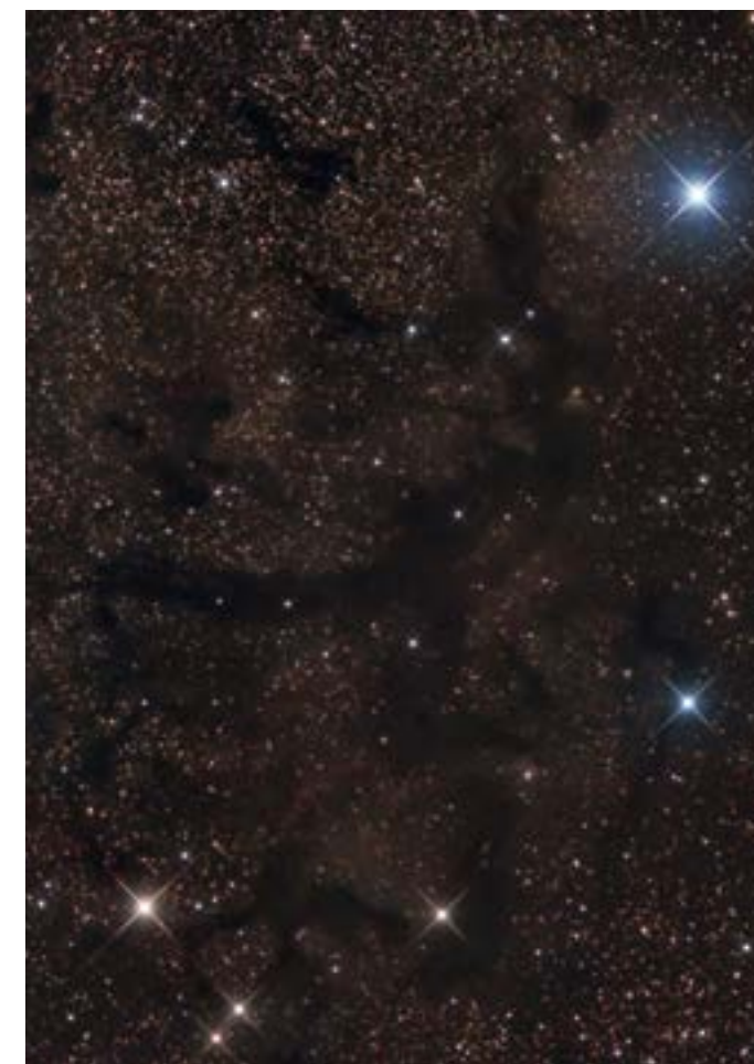
▲ TWISTED TENDRILS Left: Dark nebula LDN 673 in Aquila appears as a complex tangle of blackness spanning roughly ½°. Right: Barnard 142 and 143 together make up Barnard's E, though inky B142 is denser and more prominent against the background star field.

Angular sizes are from recent catalogs. Right ascension and declination are for equinox 2000.0.