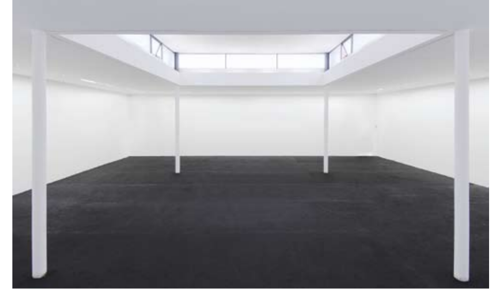
Ahmet Ögüt: Ground Control , 2007–2008; 1,312 1 / 3 sq. ft.; installation detail view from Kunst-Werke, 5th Berlin Biennial; courtesy of the artist. Photo: Uwe Walter.

Ögüt has played with the symbolism of modernity in several works, notably Ground Control (2007–2008), a minimal installation in which the entire floor of an otherwise