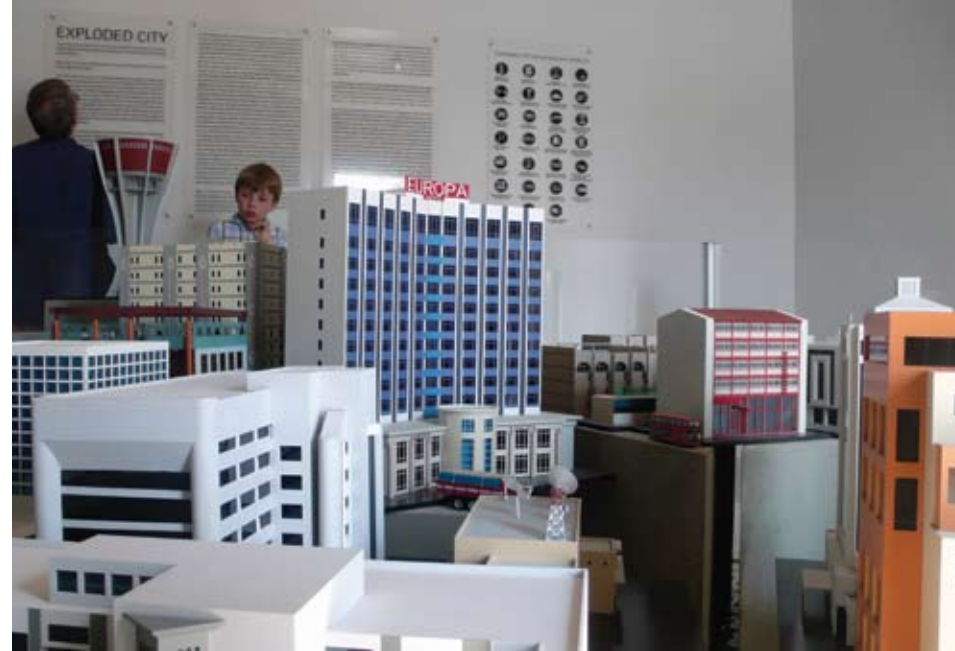
Ahmet Ögüt: Exploded City , 2009; scale model buildings, vehicles, mixed materials; 169 5/16 × 189 × 63 in.; installation detail view from Pavilion of Turkey, The 53rd Venice Biennale; courtesy of the artist. Commissioned by Istanbul Foundation for Culture and Arts (IKSV).

Born in Turkey in 1981, and living and working in Amsterdam, Ahmet Ögüt recently co-represented Turkey at the 53rd Venice Biennale. Past solo exhibitions include Künstlerhaus Bremen; Centre d'Art Santa Mònica, Barcelona; Platform Garanti, Istanbul; and Kunsthalle Basel. Recent group exhibitions include Museum of Modern Art, Warsaw; De Appel, Amsterdam; New Museum of Contemporary Art, New York; Malmö Konsthall, Sweden; Van Abbemuseum, Eindhoven, the Netherlands; the Berlin Biennale; 3rd Ghangzhou Triennial; SITE Santa Fe Biennial; and Kiasma, Helsinki. Ahmet Ögüt received his B.A. from the Fine Arts Faculty of Hacettepe University in 2003 and his M.F.A. from the Art and Design Faculty of Yildiz Technical University in 2006. This is the artist's first solo exhibition in the United States. Upcoming solo exhibitions in 2010 include Museum Villa Stuck, Munich; Galerie für Zeitgenössische Kunst, Leipzig; and Artspace Visual Arts Centre, Sydney.